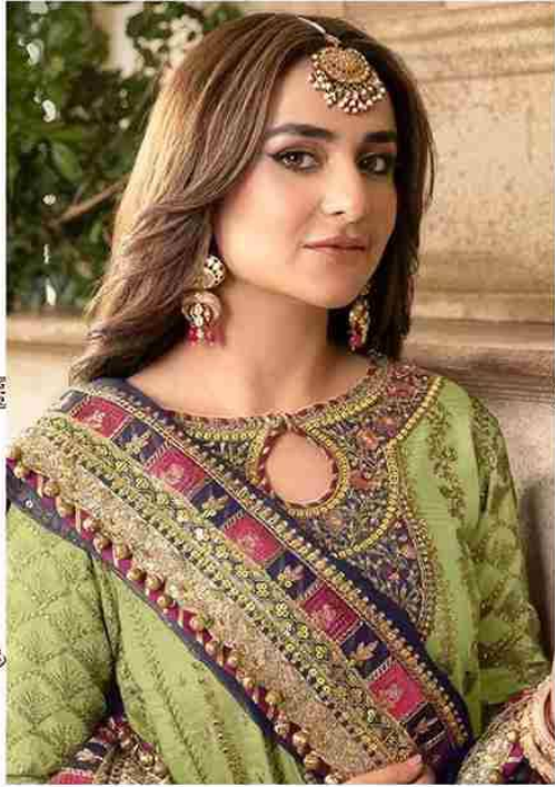
D.NO.175 - A

TOP - GEORGETTE HEAVY EMBROIDERY SEQUINS WORK BOTTOM - DULL SANTOON DUPATTA - HEAVY NAZAMIN WITH EMBROIDERY WORK INEER - DULL SANTOON