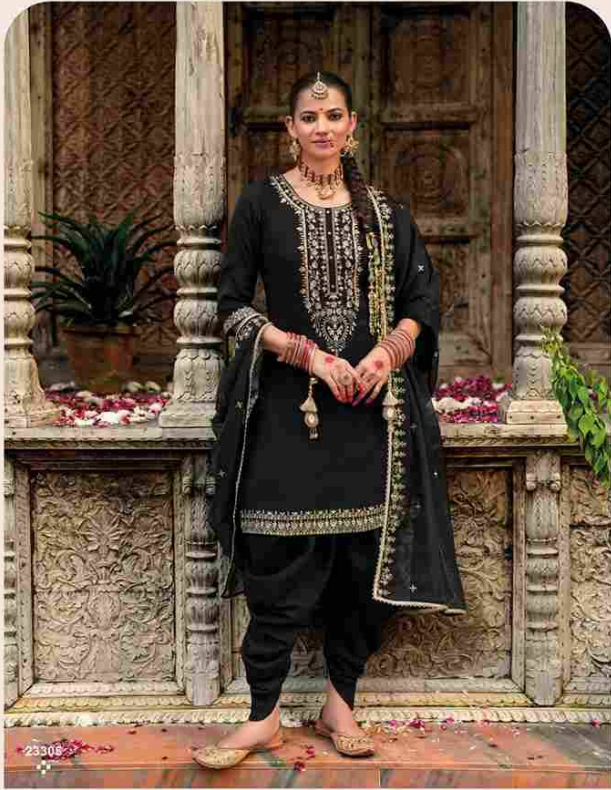
Elegance is not standing out, but being remembered