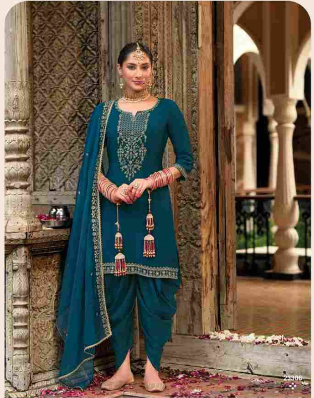
Fashion is about dreaming and making other people dream