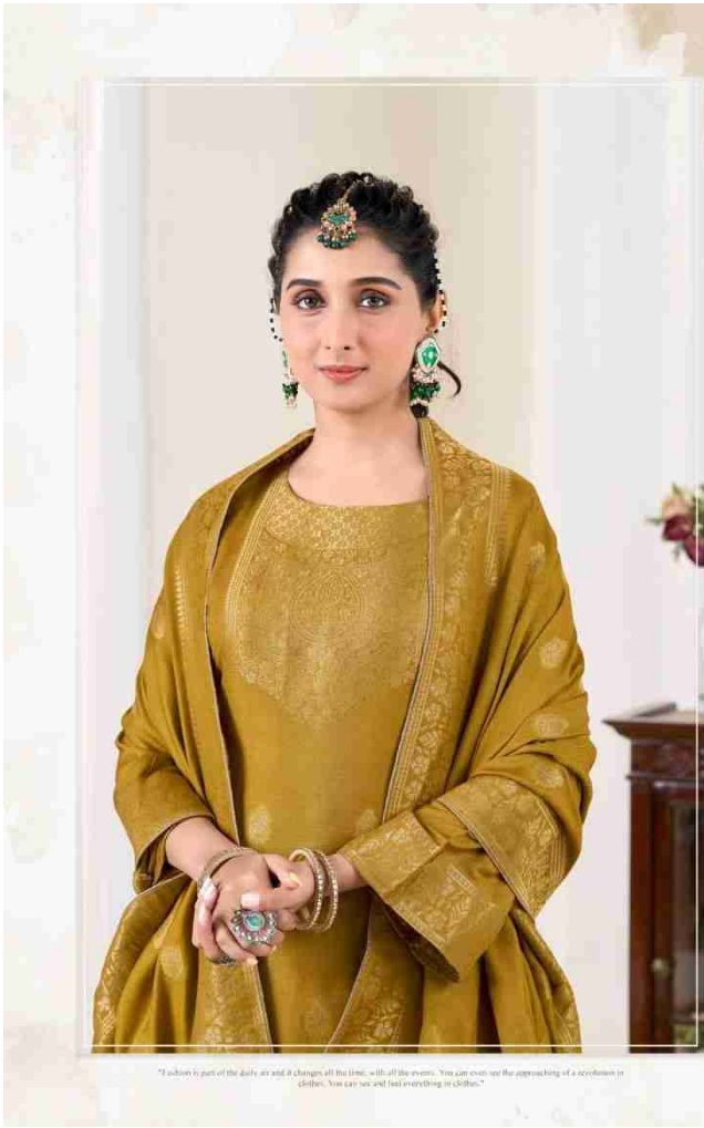
"Fashion is part of the daily air and it changes all the time, with all the events. You can even see the approaching of a revolution in clothes. You can see and feel everything in clothes."