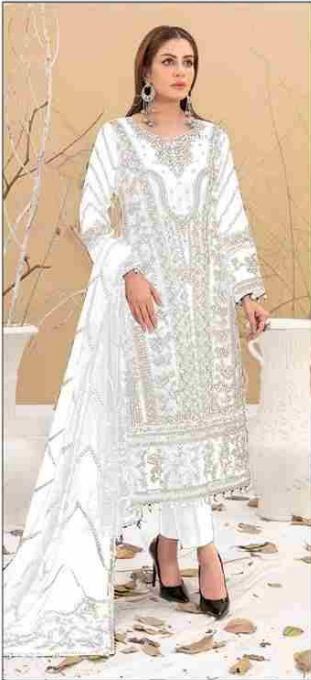
S - 360 A

TOP - ORGANZA HEAVY EMBROIDEREY WORK WITH JARKAN INNER BOTTOM - DULL SANTOON DUPATTA - ORGANZA HEAVY EMBROIDEREY WORK