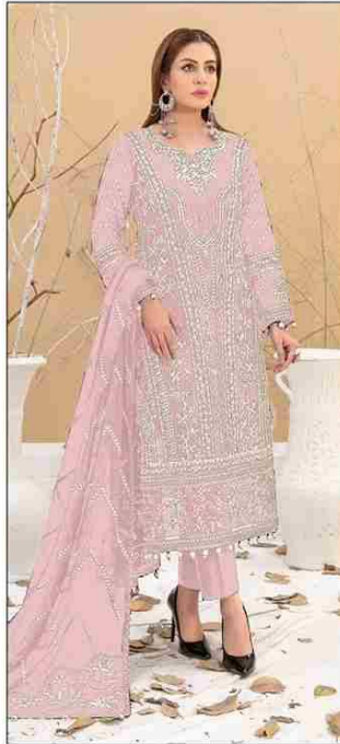
S - 360 C