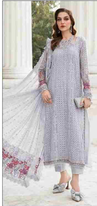
S - 366 C