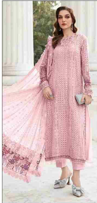
S - 366 B