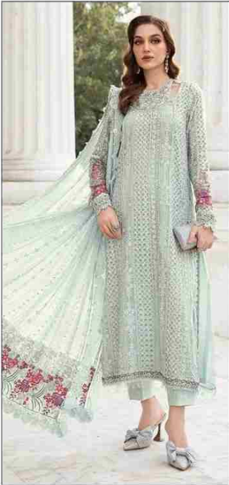
S - 366 A