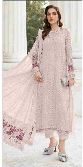
S - 366 D