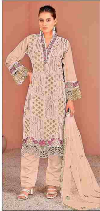
B - 103 B