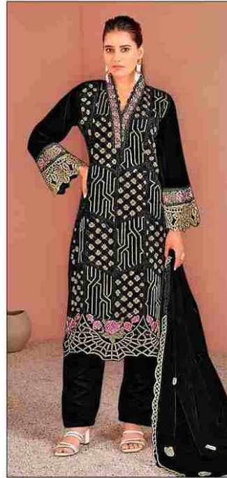
B - 103 C