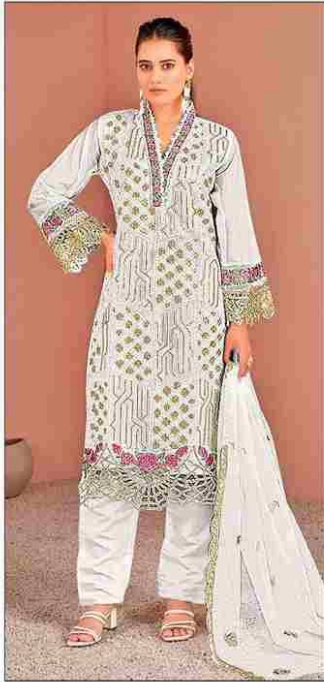
B - 103 A