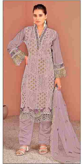
B - 103 D