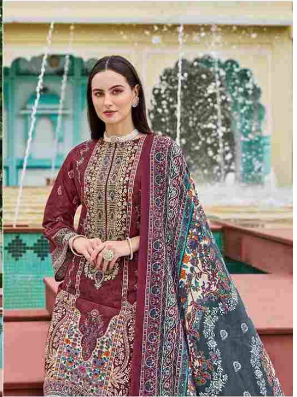
1003-002 "Fashion offers an alternate way of being, crossing and merging, racial and nationalities."