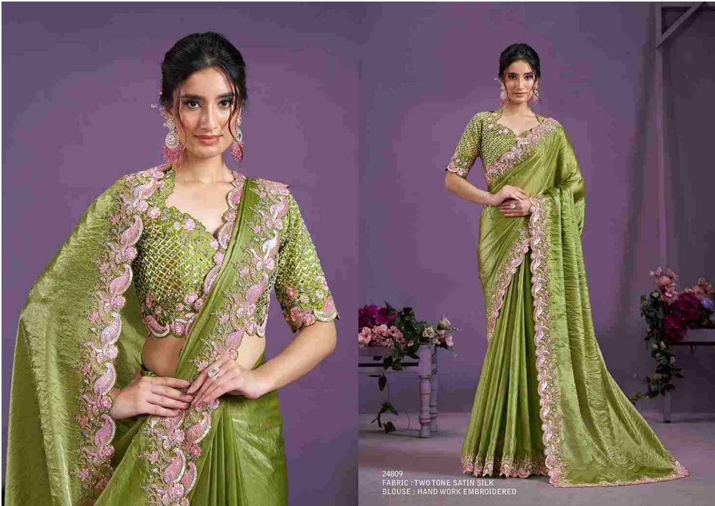
24809 FABRIC : TWO TONE SATIN SILK BLOUSE : HAND WORK EMBROIDERED