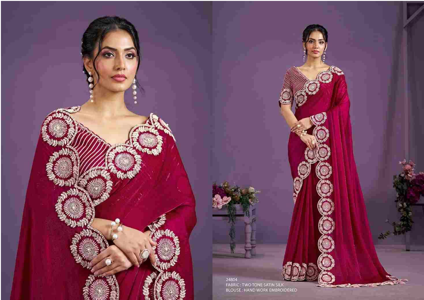
24804 FABRIC: TWO TONE SATIN SILK BLOUSE: HAND WORK EMBROIDERED