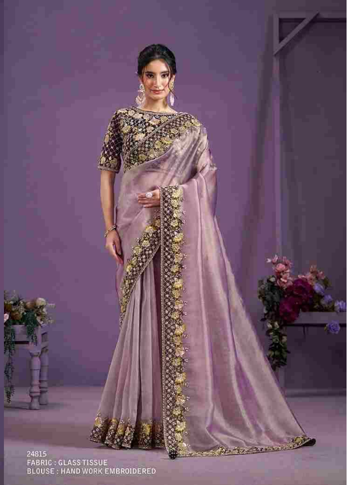
24815 FABRIC : GLASS TISSUE BLOUSE : HAND WORK EMBROIDERED