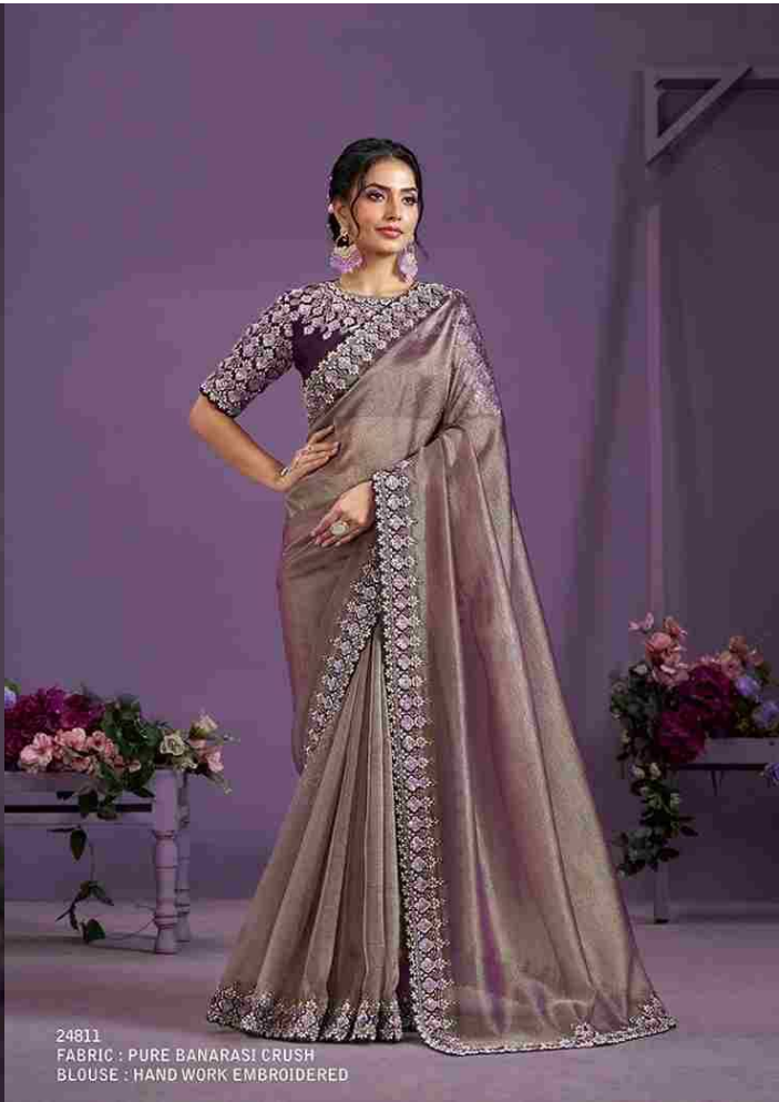
24811 FABRIC : PURE BANARASI CRUSH BLOUSE : HAND WORK EMBROIDERED