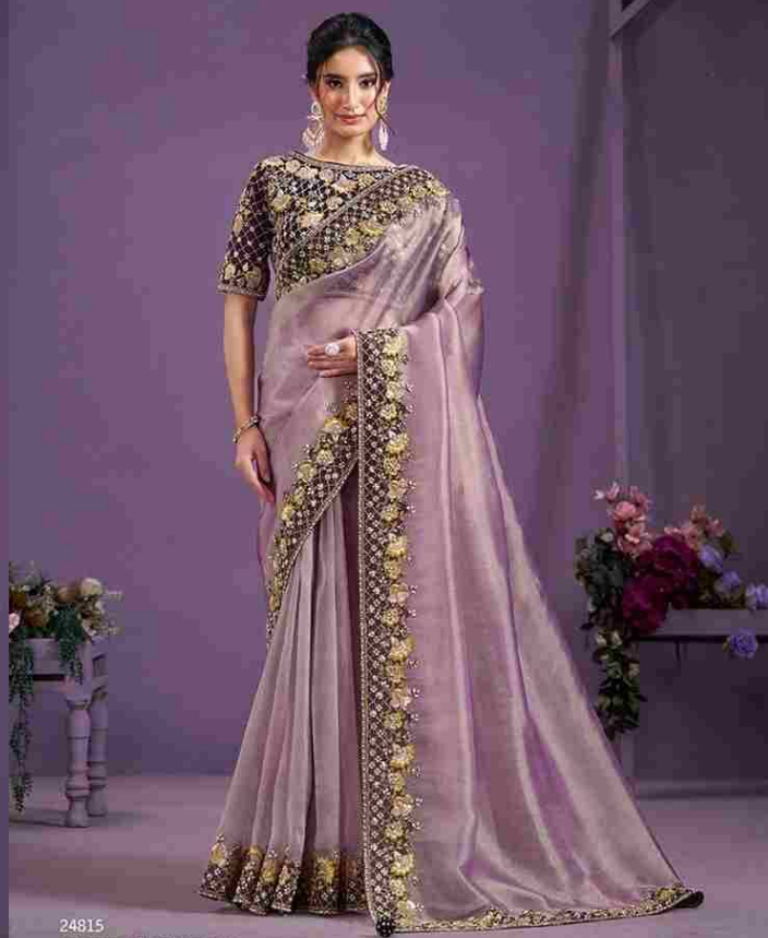
24815 FABRIC : GLASS TISSUE BLOUSE : HAND WORK EMBROIDERED