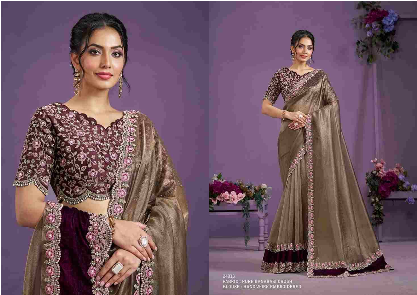
24813 FABRIC : PURE BANARASI CRUSH BLOUSE : HAND WORK EMBROIDERED