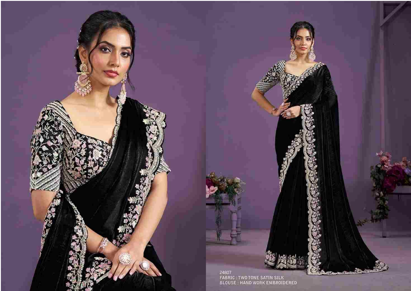
24807 FABRIC : TWO TONE SATIN SILK BLOUSE : HAND WORK EMBROIDERED