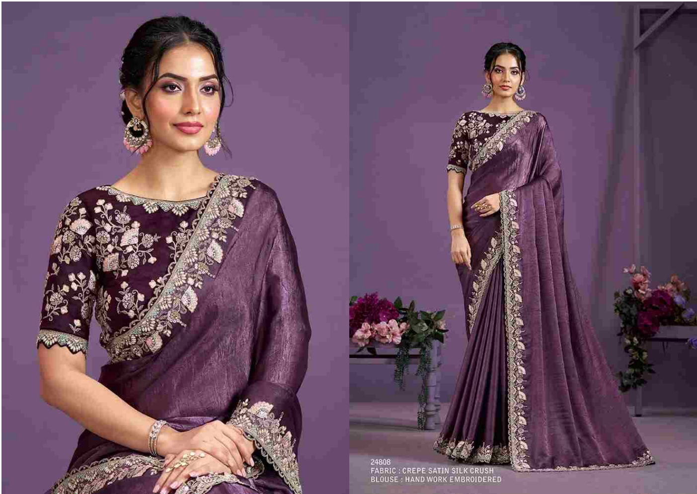
24808 FABRIC : CREPE SATIN SILK CRUSH BLOUSE : HAND WORK EMBROIDERED