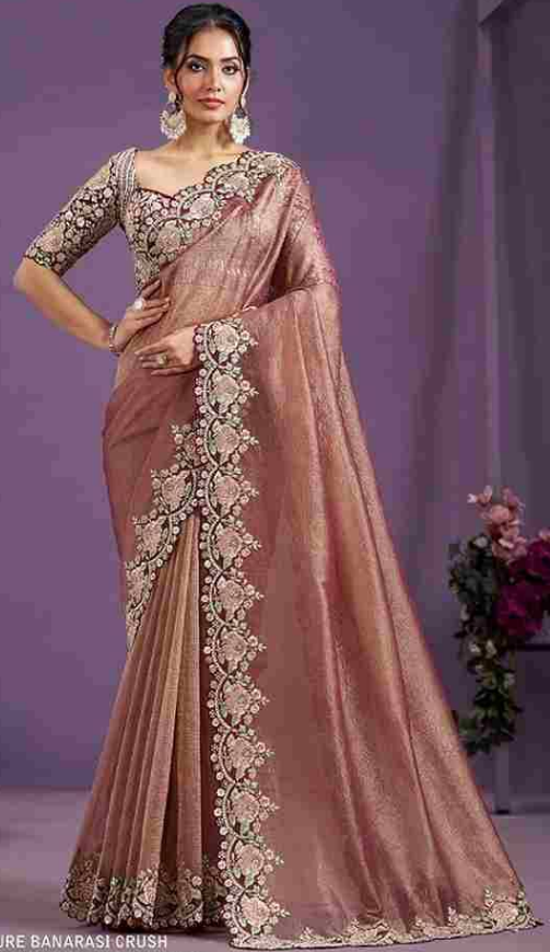
24806 FABRIC : PURE BANARASI CRUSH BLOUSE : HAND WORK EMBROIDERED