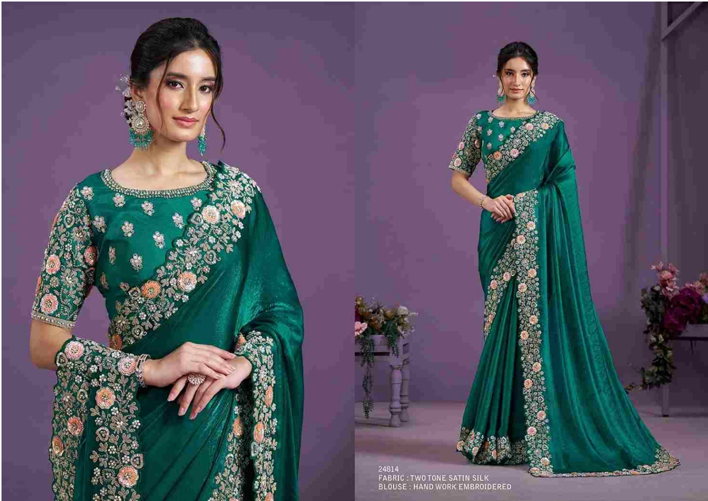
24814 FABRIC : TWO TONE SATIN SILK BLOUSE : HAND WORK EMBROIDERED