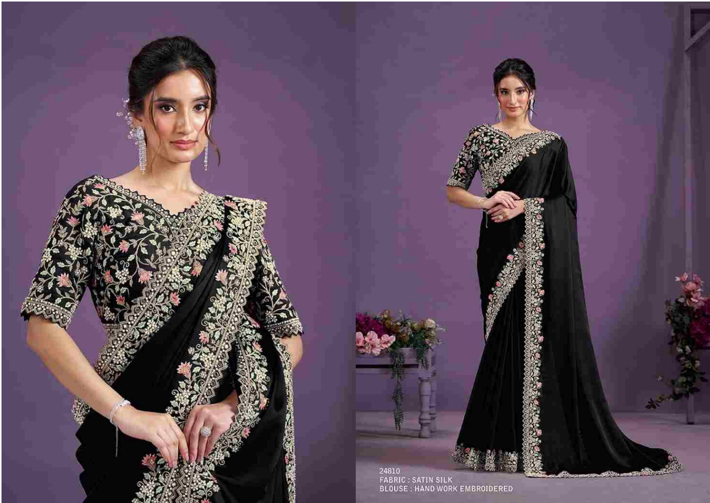
24810 FABRIC : SATIN SILK BLOUSE : HAND WORK EMBROIDERED