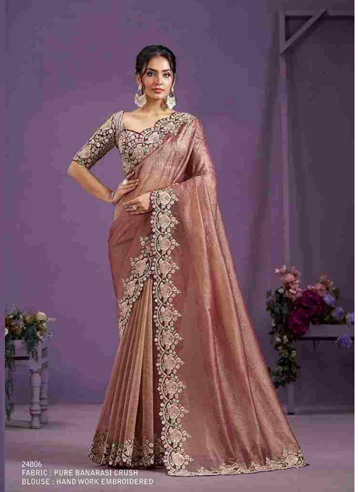
24806 FABRIC : PURE BANARASI CRUSH BLOUSE : HAND WORK EMBROIDERED