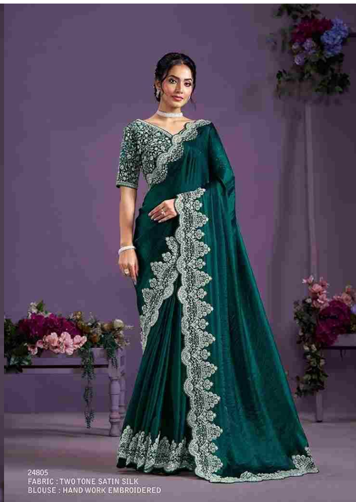
24805 FABRIC : TWO TONE SATIN SILK BLOUSE : HAND WORK EMBROIDERED