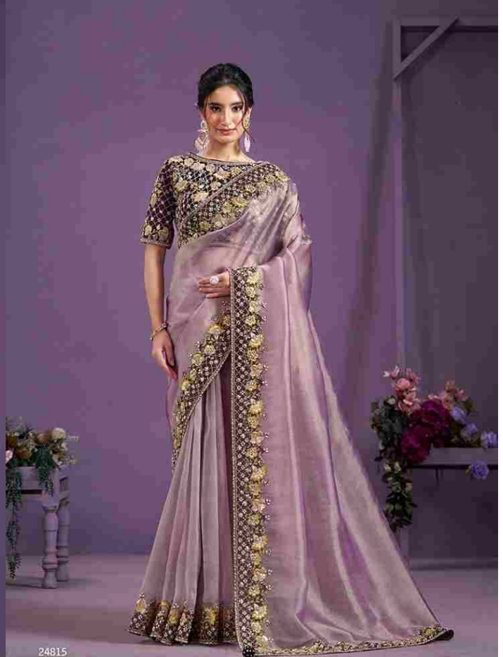
24815 FABRIC : GLASS TISSUE BLOUSE : HAND WORK EMBROIDERED