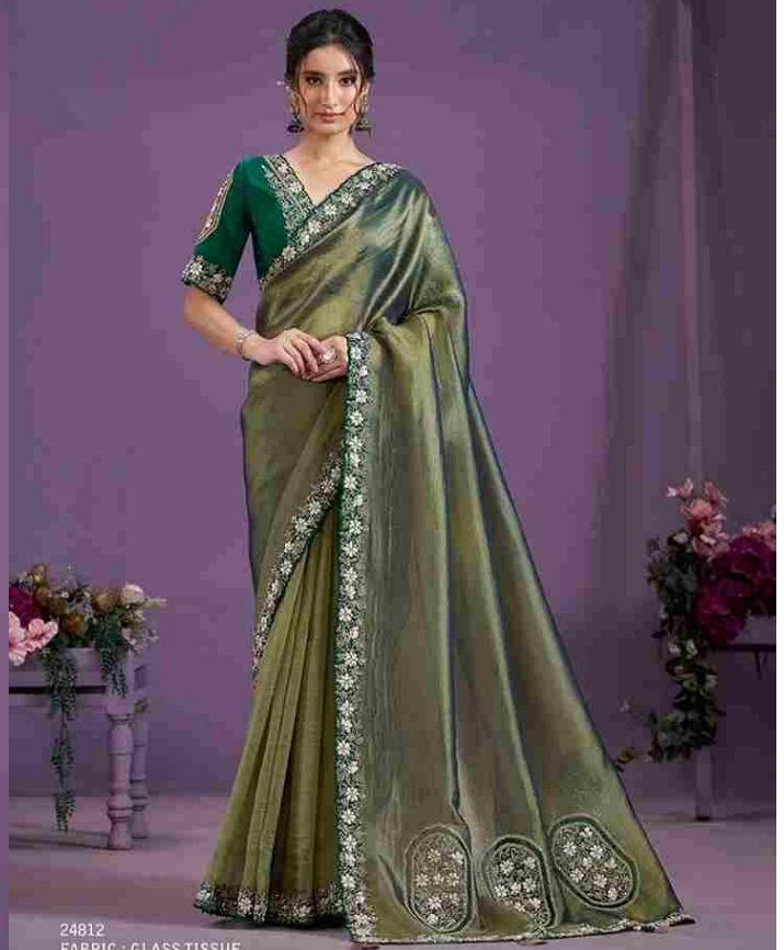
24812 FABRIC : GLASS TISSUE BLOUSE : HAND WORK EMBROIDERED