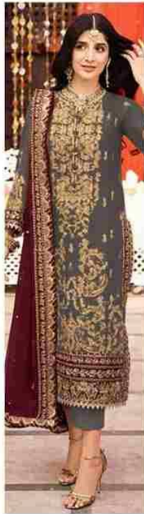
D.NO.179 - A