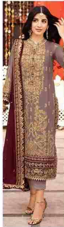
D.NO.179 - B