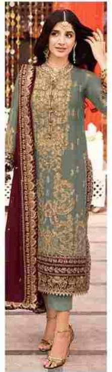
D.NO.179 - D