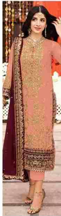
D.NO.179 - C