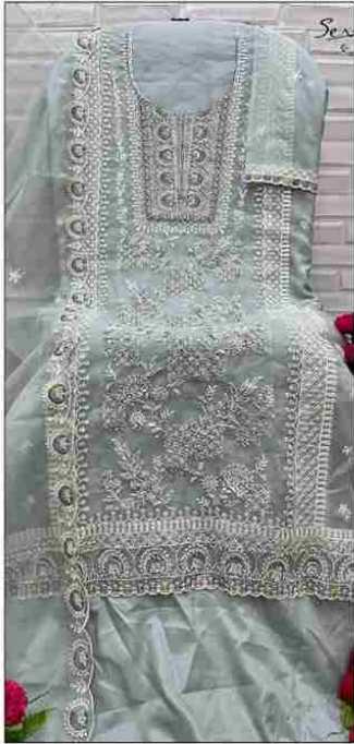
S - 379 A

Top - organza heavy embroidery work with zarkan work Bottom inner - dull santun Dupatta - organza heavy embroidery work