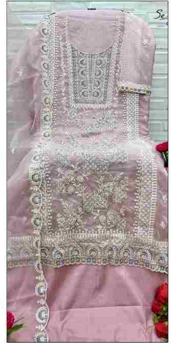
S - 379 D