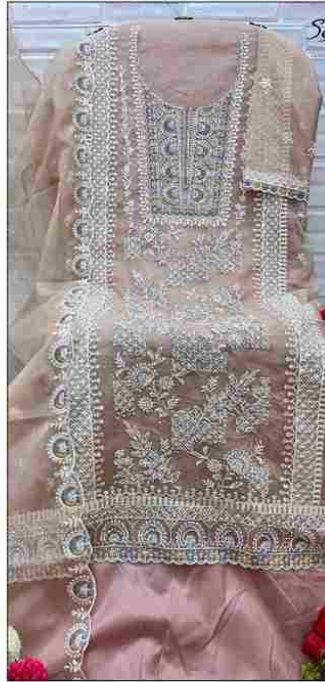
S - 379 B