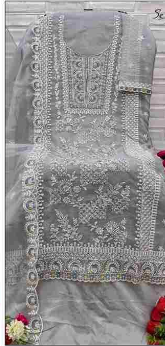
S - 379 C