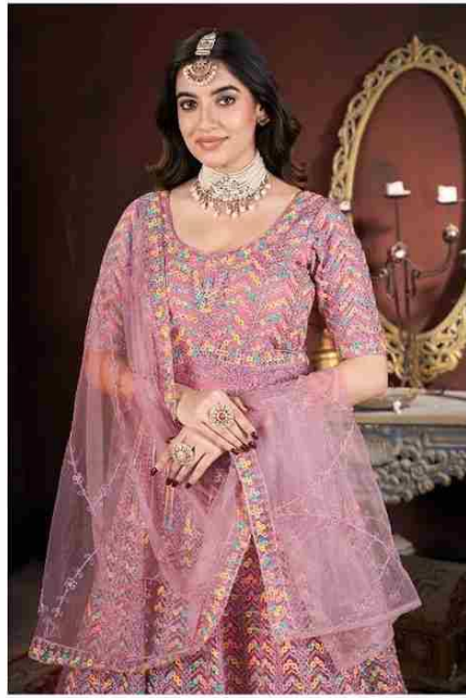
Rare, Elegant and Alluring, a rich heritage of Indian craftsmanship and tradition unfolds in the new form of lehenga.