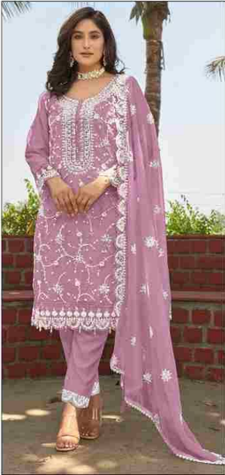
S - 364 E

Top :- organza havi embroidery work with khatli BITS work Bottom:- innar dull santun Dupatta:- organza havi embroidery work with khatli BITS work