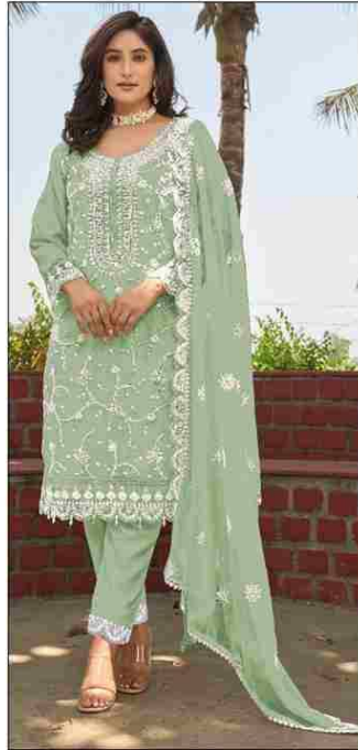
S - 364 F