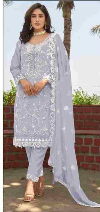
S - 364 G