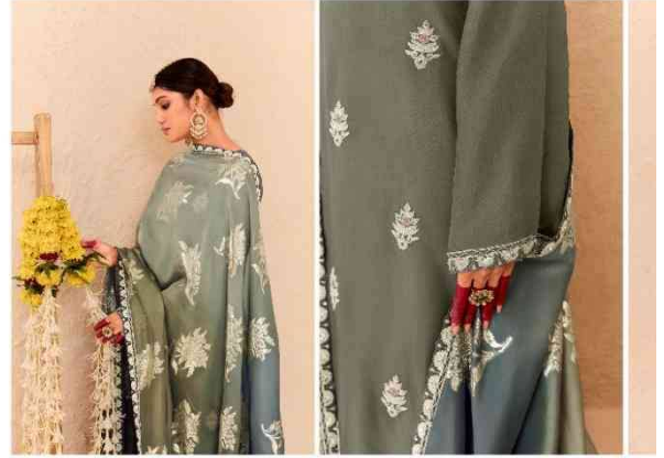
The dress was adorned with sparkling sequins that shimmered in the spotlight