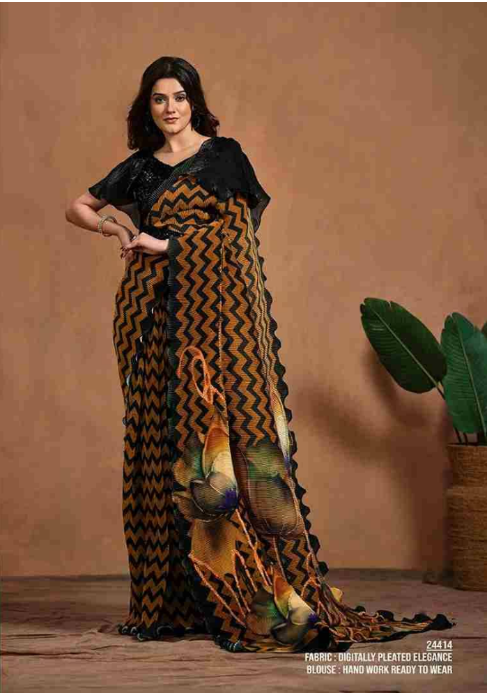
24414 FABRIC : DIGITALLY PLEATED ELEGANCE BLOUSE : HAND WORK READY TO WEAR