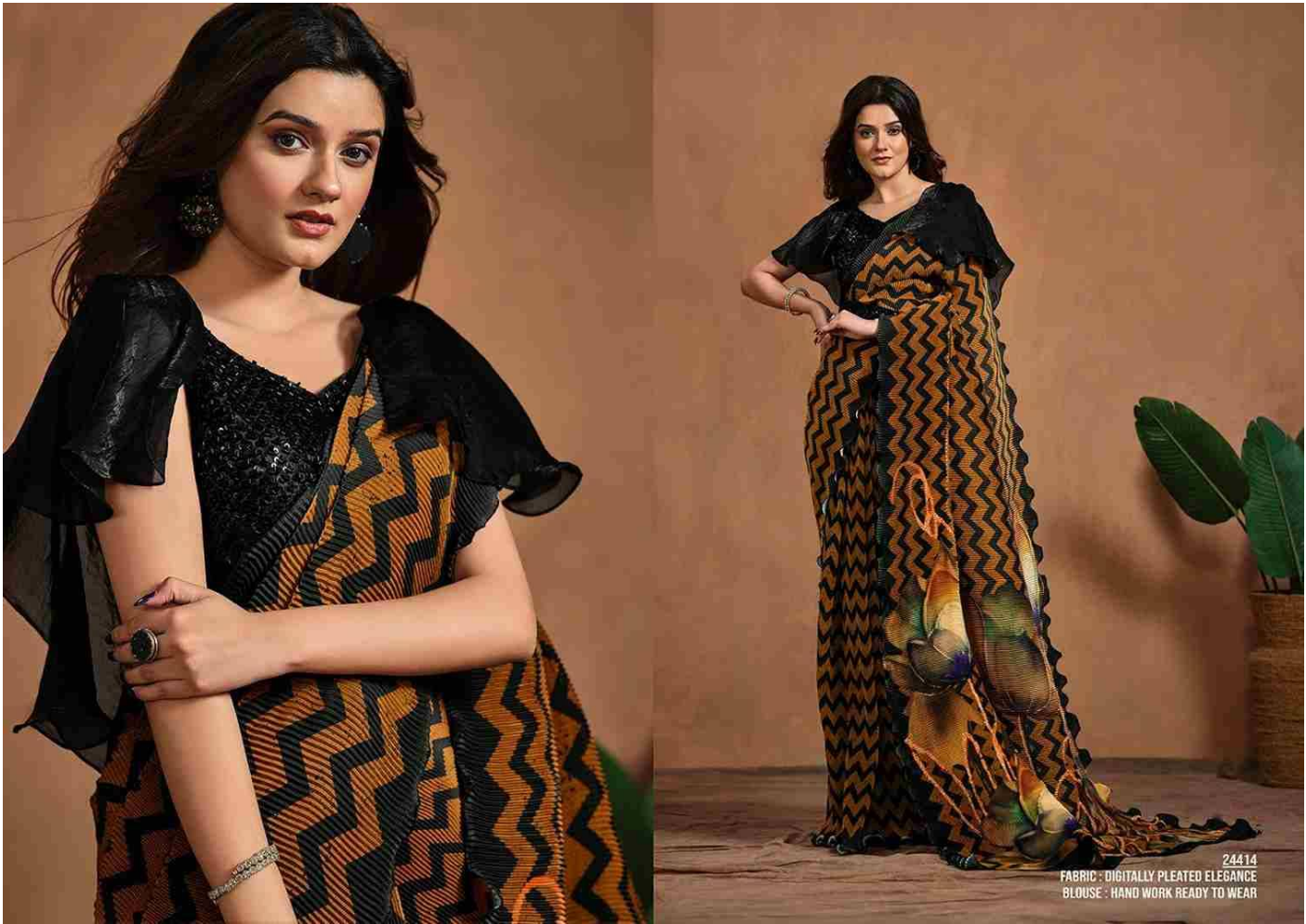
24414 FABRIC : DIGITALLY PLEATED ELEGANCE BLOUSE : HAND WORK READY TO WEAR