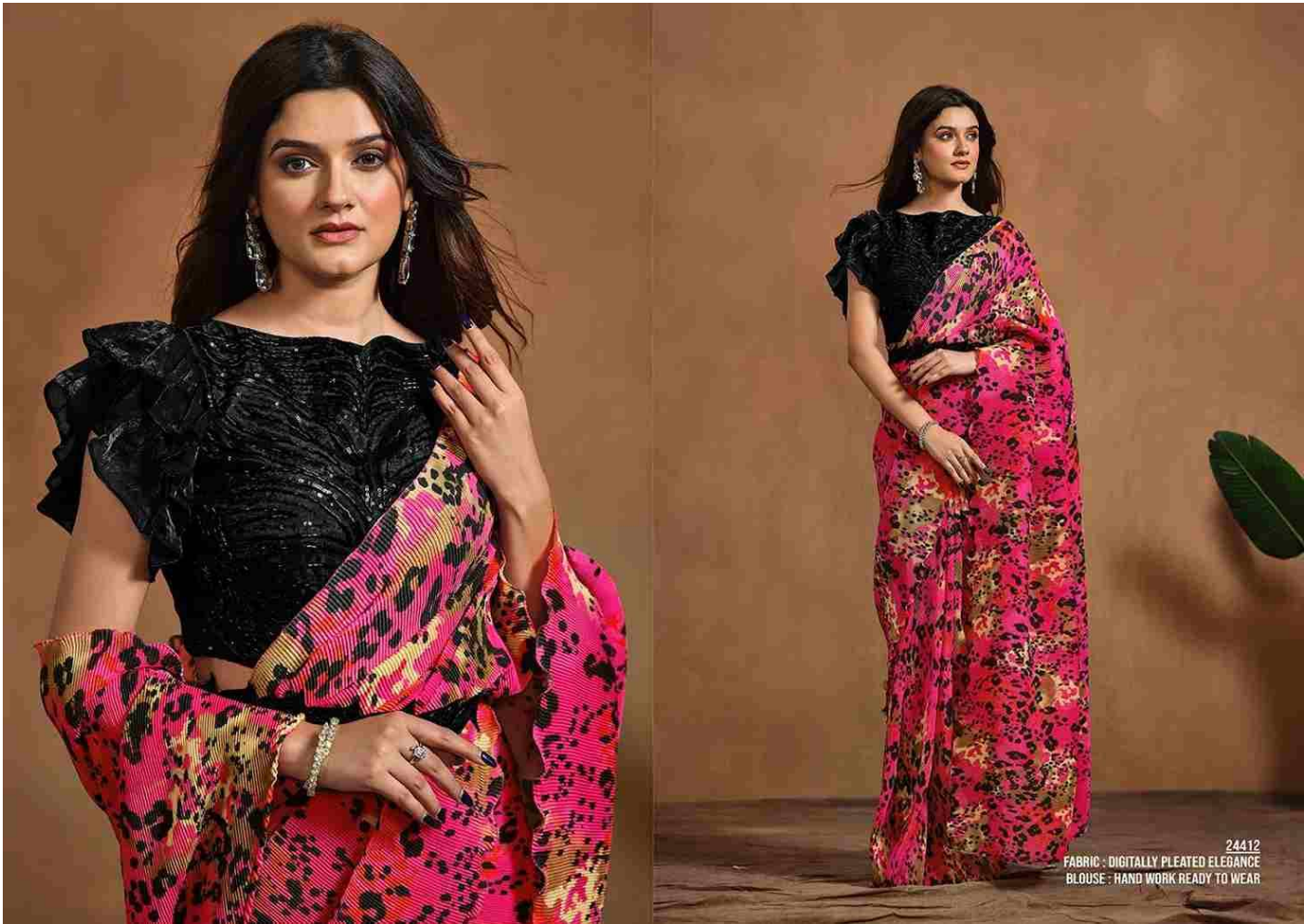
24412 FABRIC : DIGITALLY PLEATED ELEGANCE BLOUSE : HAND WORK READY TO WEAR