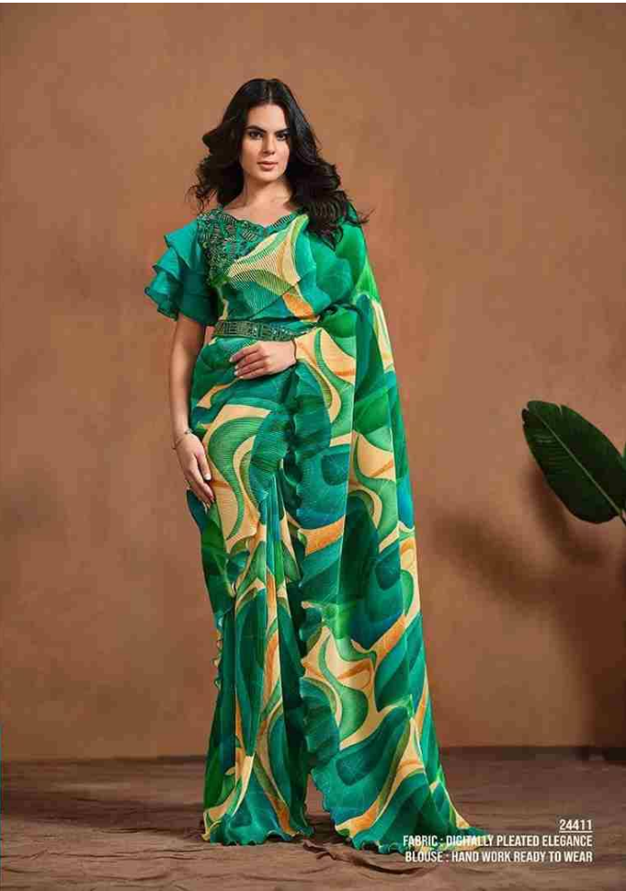
24411 FABRIC - DIGITALLY PLEATED ELEGANCE BLOUSE - HAND WORK READY TO WEAR