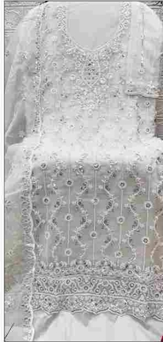
S - 414 B