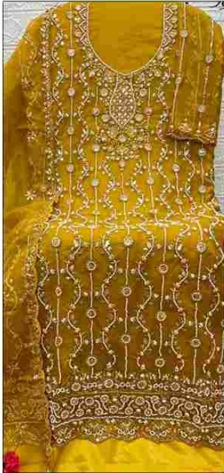
S - 414 A