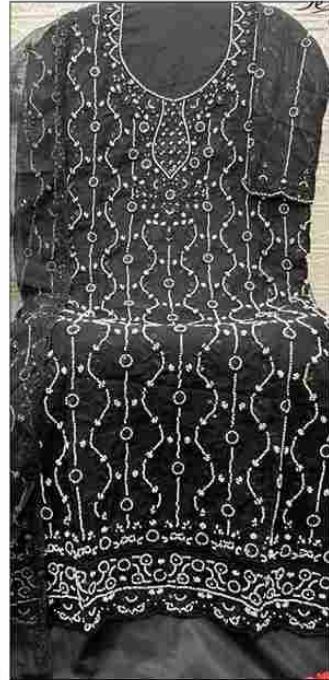
S - 414 C