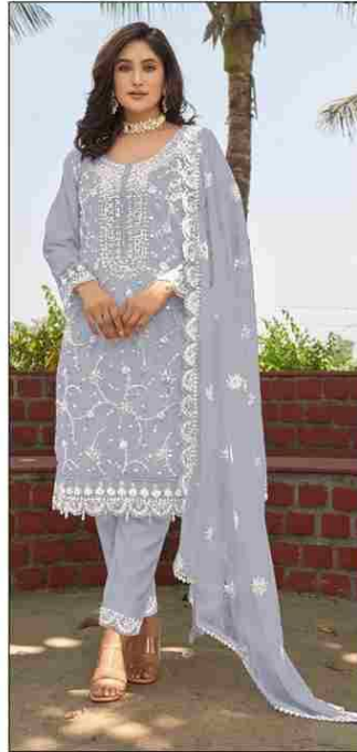
S - 437 C