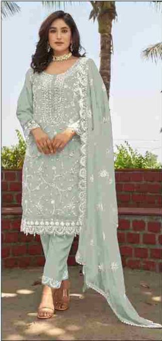
S - 437 A