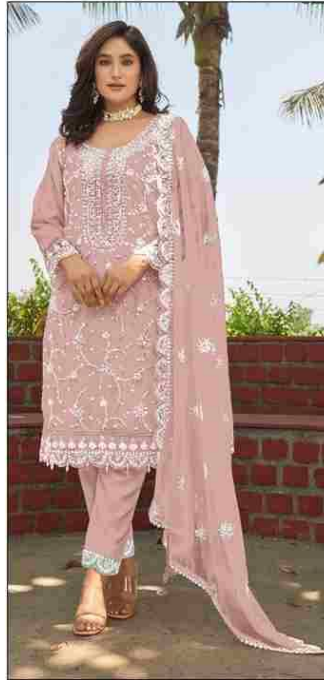
S - 437 B