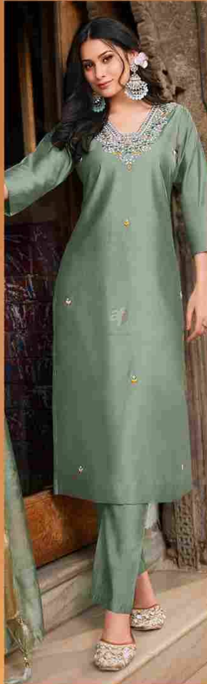
4112 Mayra VOL-6