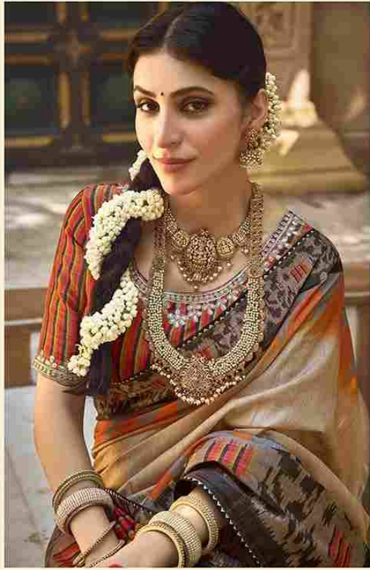
Reflecting beauty and grace in every look.