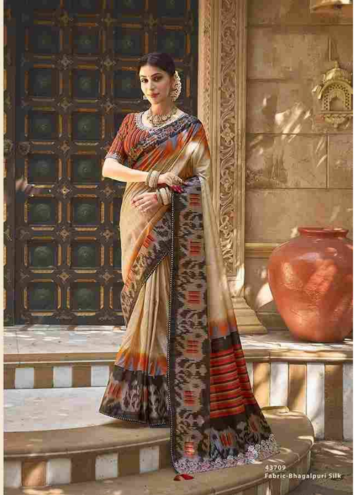
43709 Fabric-Bhagalpuri Silk