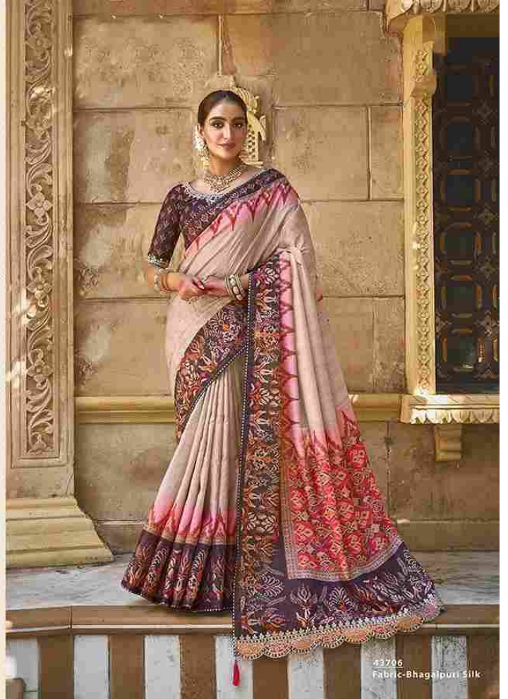
43706 Fabric-Bhagalpuri Silk