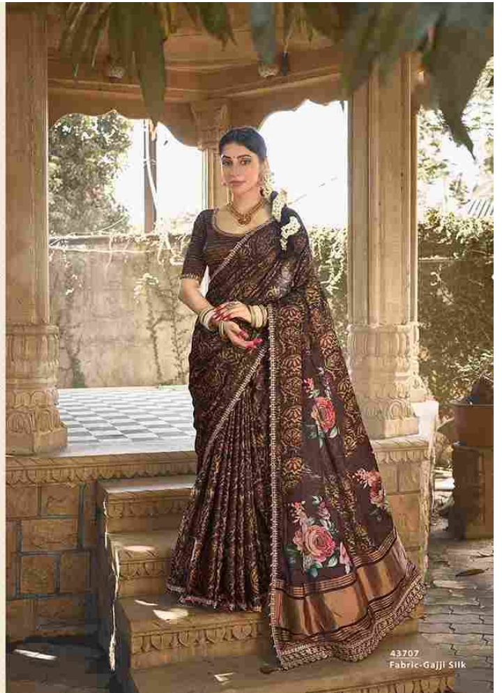
43707 Fabric-Gajji Silk