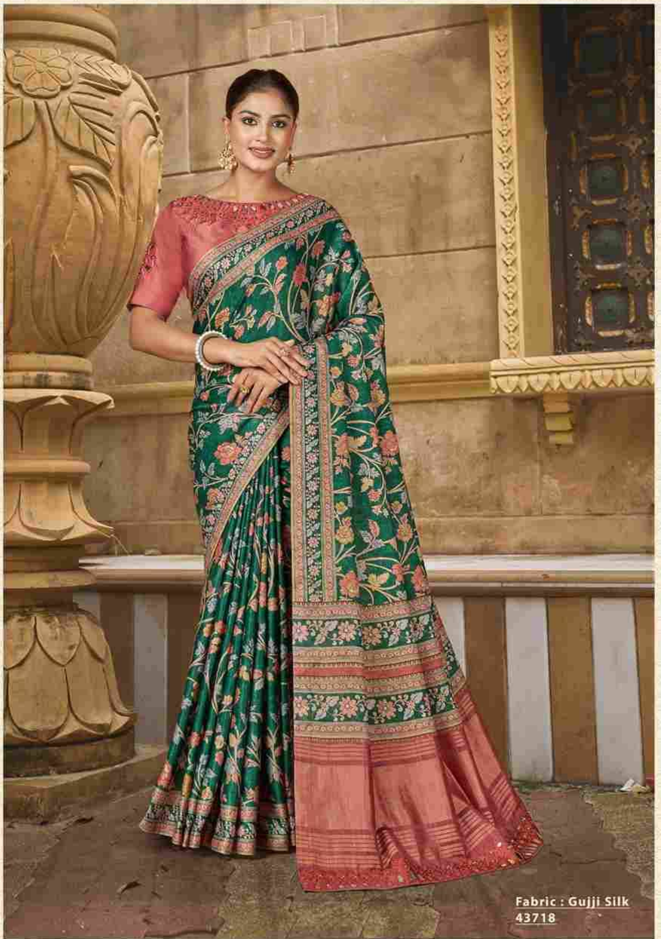
Fabric : Gujji Silk 43718