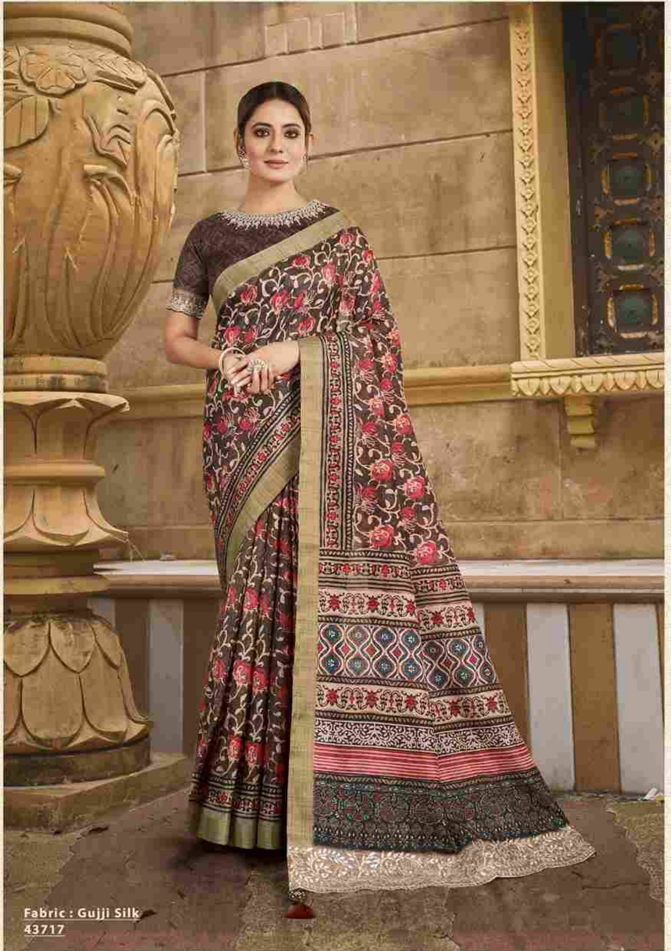
Fabric : Gujji Silk 43717