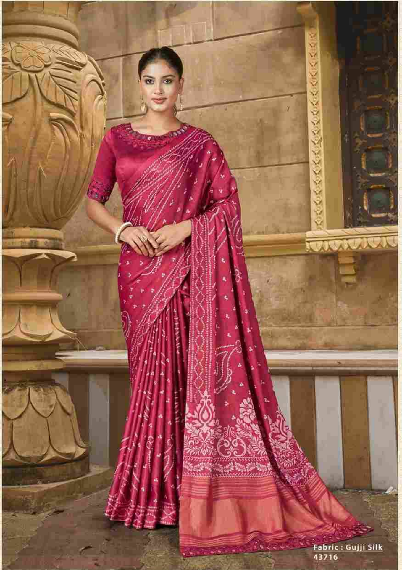
Fabric : Gujji Silk 43716