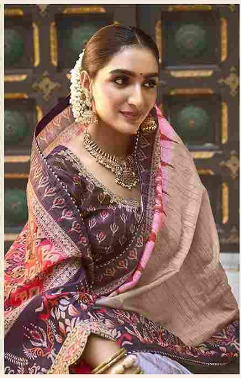
Gajras are popular for their pleasant fragrance, which is believed to have a calming effect on the mind.