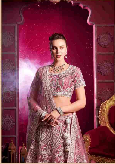
Colorful threads, vivid dreams in every lehenga fold