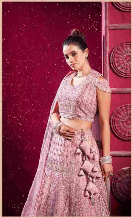
Colorful threads, vivid dreams in every lehenga fold