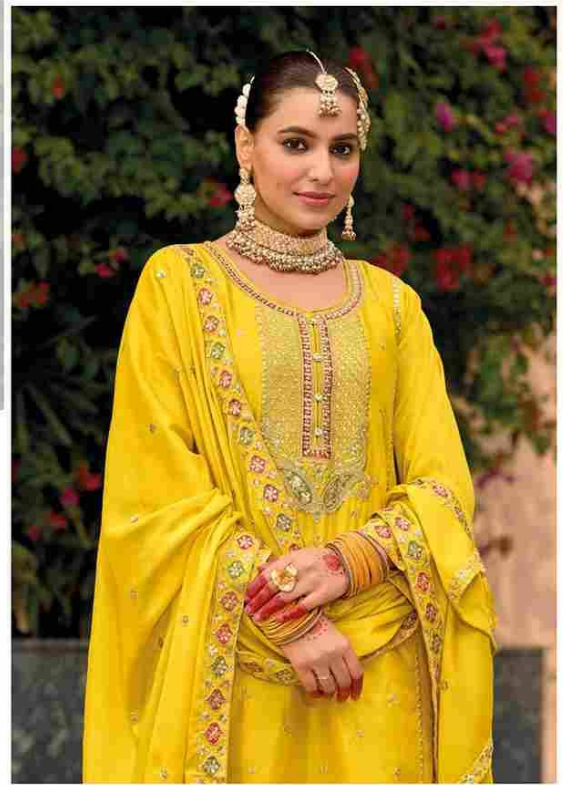
1778 BEING YOU Fashion is the art of being you