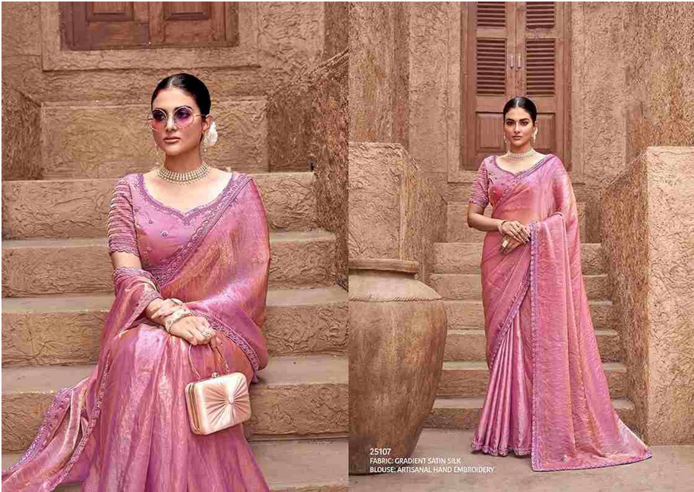
25107 FABRIC: GRADIENT SATIN SILK BLOUSE: ARTISANAL HAND EMBROIDERY