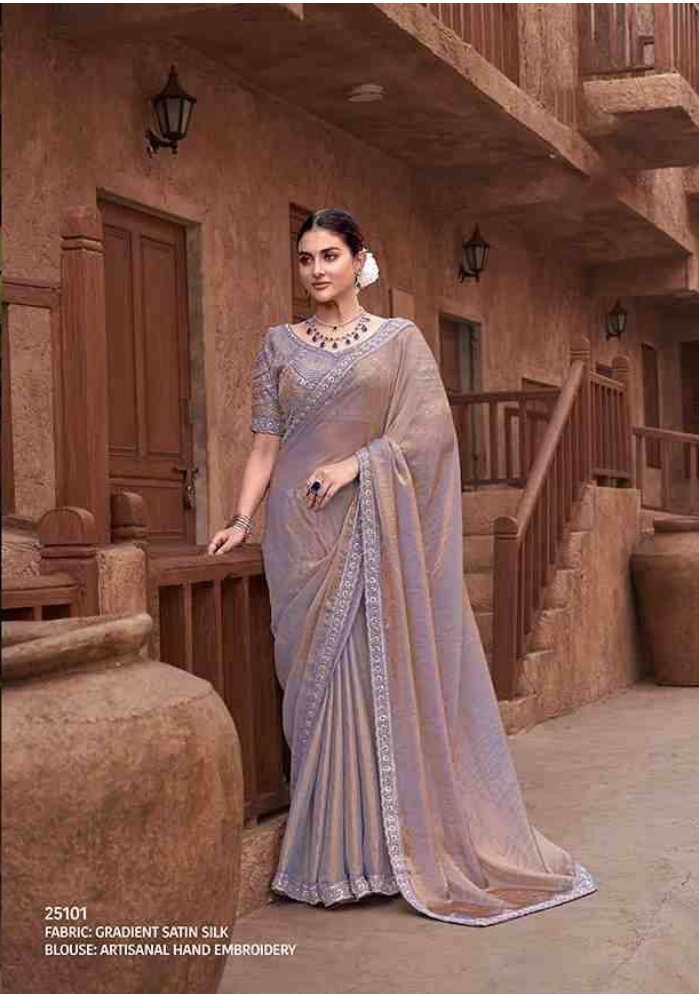
25101 FABRIC: GRADIENT SATIN SILK BLOUSE: ARTISANAL HAND EMBROIDERY