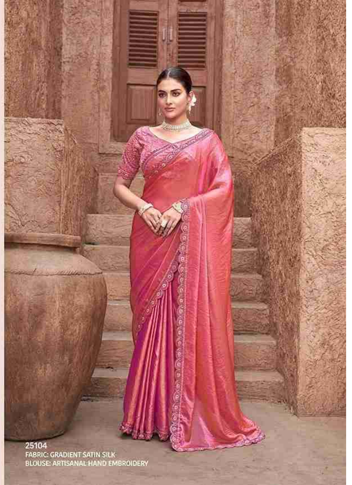
25104 FABRIC: GRADIENT SATIN SILK BLOUSE: ARTISANAL HAND EMBROIDERY