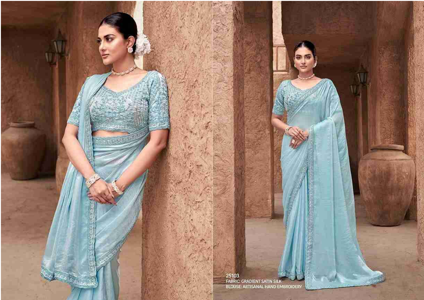
25103 FABRIC: GRADIENT SATIN SILK BLOUSE: ARTISANAL HAND EMBROIDERY