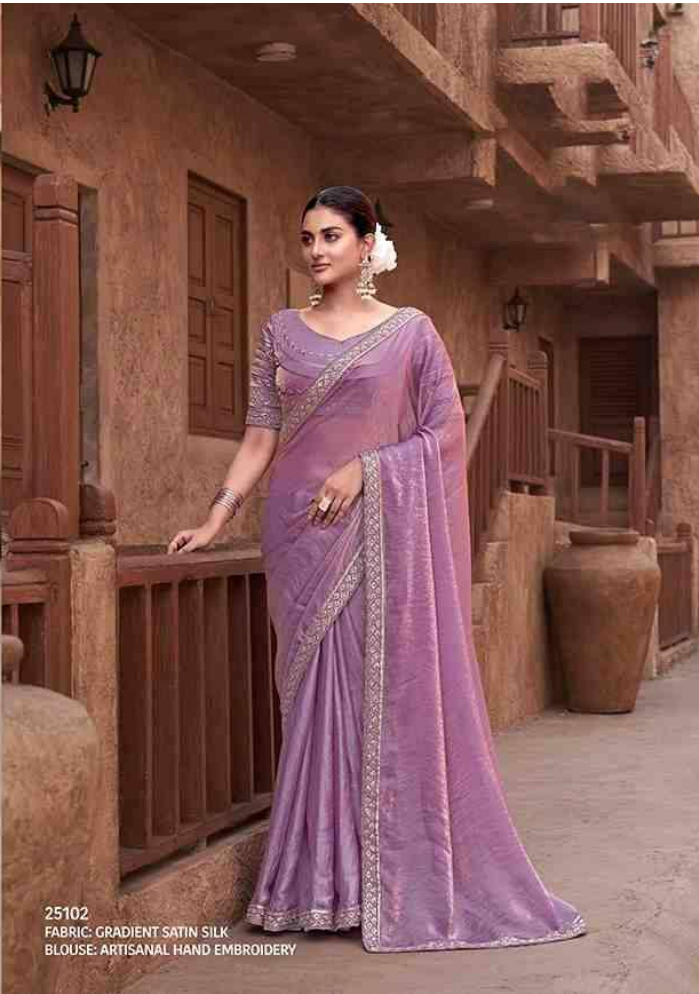
25102 FABRIC: GRADIENT SATIN SILK BLOUSE: ARTISANAL HAND EMBROIDERY