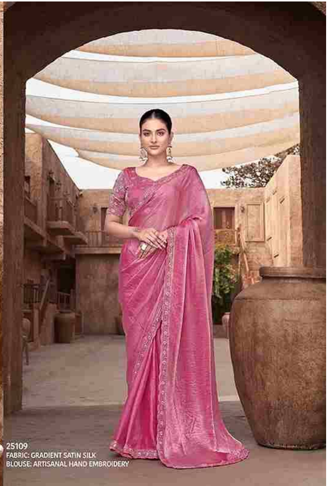
25109 FABRIC: GRADIENT SATIN SILK BLOUSE: ARTISANAL HAND EMBROIDERY