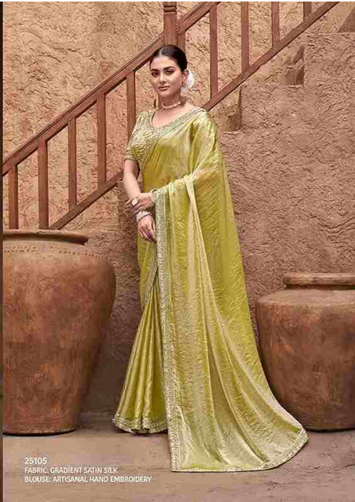
25105 FABRIC: GRADIENT SATIN SILK BLOUSE: ARTISANAL HAND EMBROIDERY