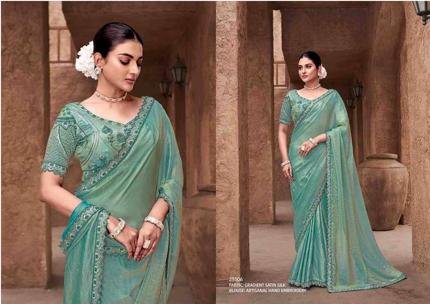
25106 FABRIC: GRADIENT SATIN SILK BLOUSE: ARTISANAL HAND EMBROIDERY