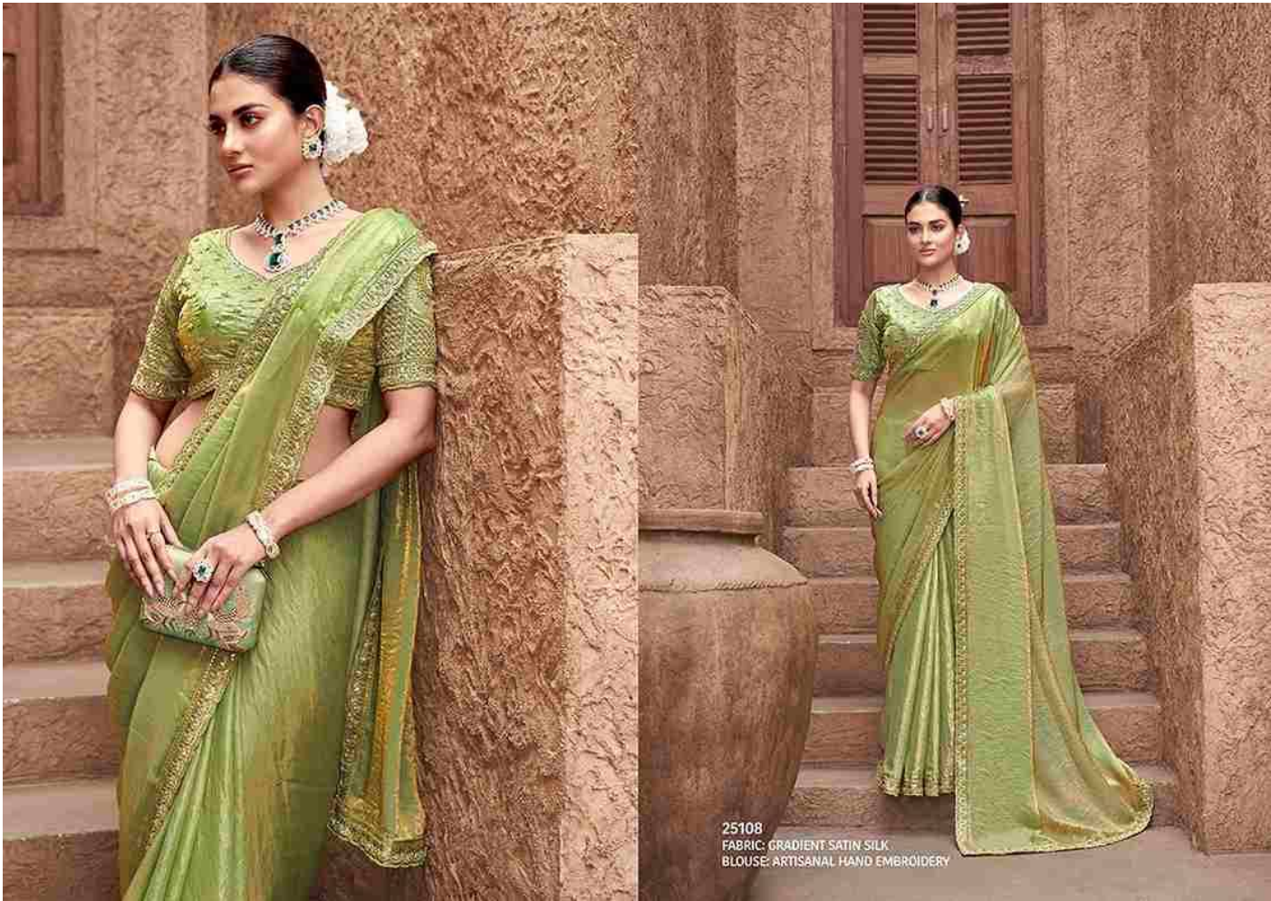
25108 FABRIC: GRADIENT SATIN SILK BLOUSE: ARTISANAL HAND EMBROIDERY