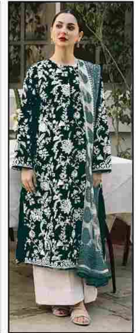
JT D.NO.157 I

TOP:- REYON COTTON HEAVY FRONT AND BACK BOTH SIDE EMBROIDERED