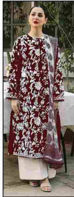
JT D.NO.157 H