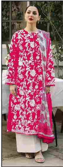
JT D.NO.157 F