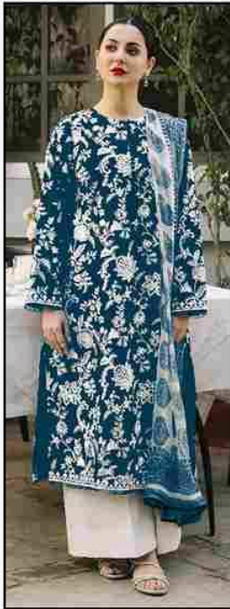
JT D.NO.157 E