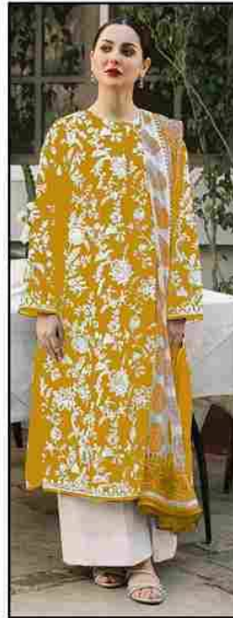
JT D.NO.157 G