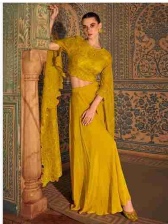
D NO : 5739