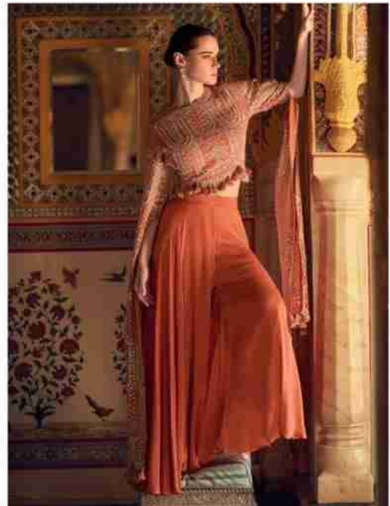
D NO : 5741