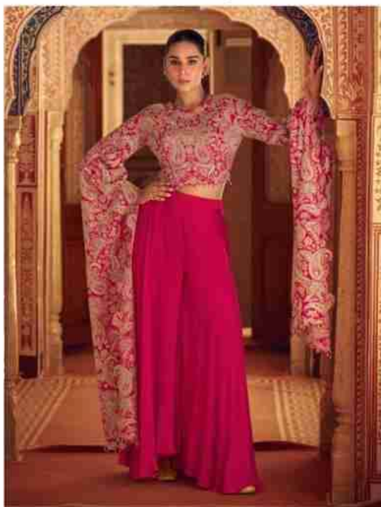
D NO : 5738