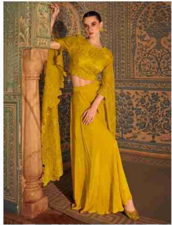
D NO : 5739