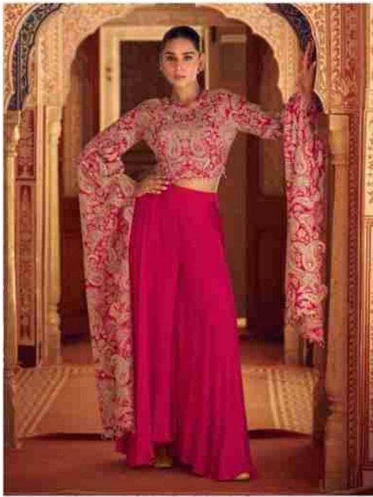
D NO : 5738