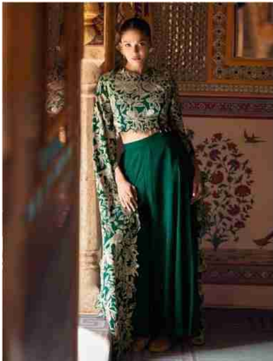
D NO : 5740