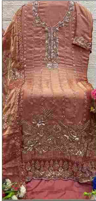
S - 501 B