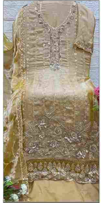
S - 501 D