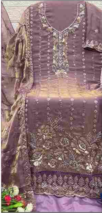
S - 501 A

TOP - FRANDY SILK FABRIC WITH HEAVY EMBROIDERY BITS KHATLI WORK BOTTOM/INNER - DULL SHANTUN DUPATTA - FRANDY SILK HEAVY EMBROIDERY WORK