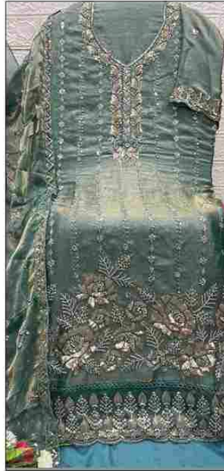
S - 501 C