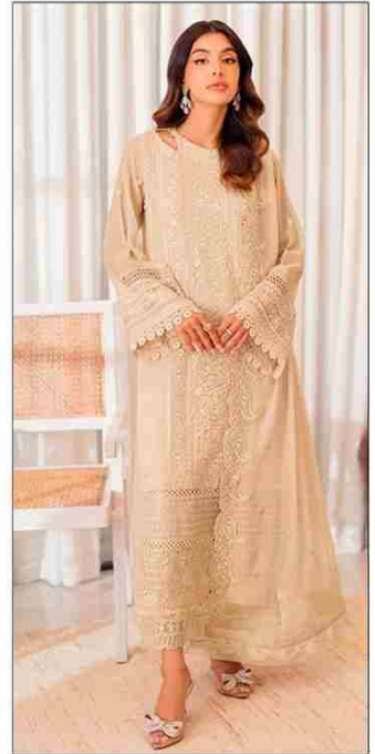
S - 503 D