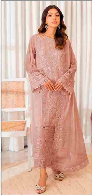
S - 503 A