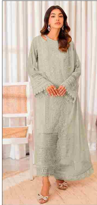
S - 503 B