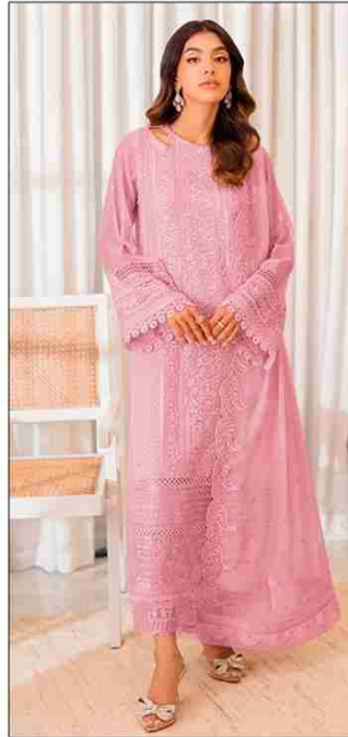
S - 503 C