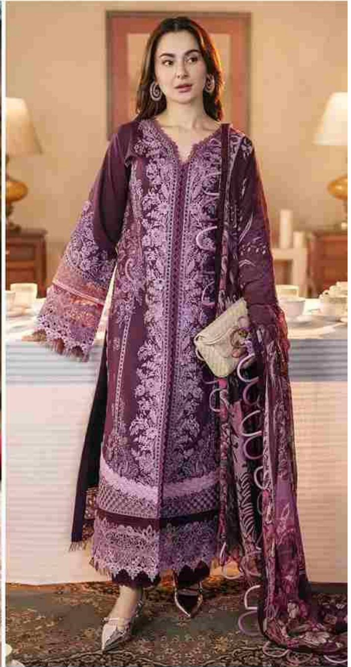
D NO 26002

TOP:- PURE COTTON WITH HEAVY EMBROIDERY CHIKANKARI WORK BOTTOM:- COTTON DUPATTA:- MUSLIN COTTON WITH DIGITAL PRINT