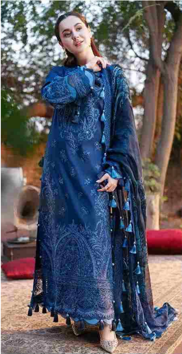
D NO 26001