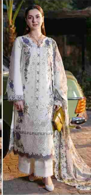
D NO 25004