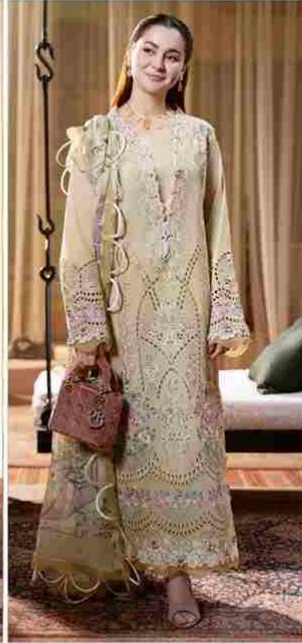
D NO 25003