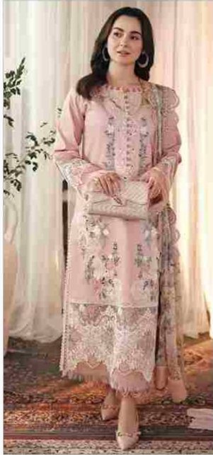
D NO 25001