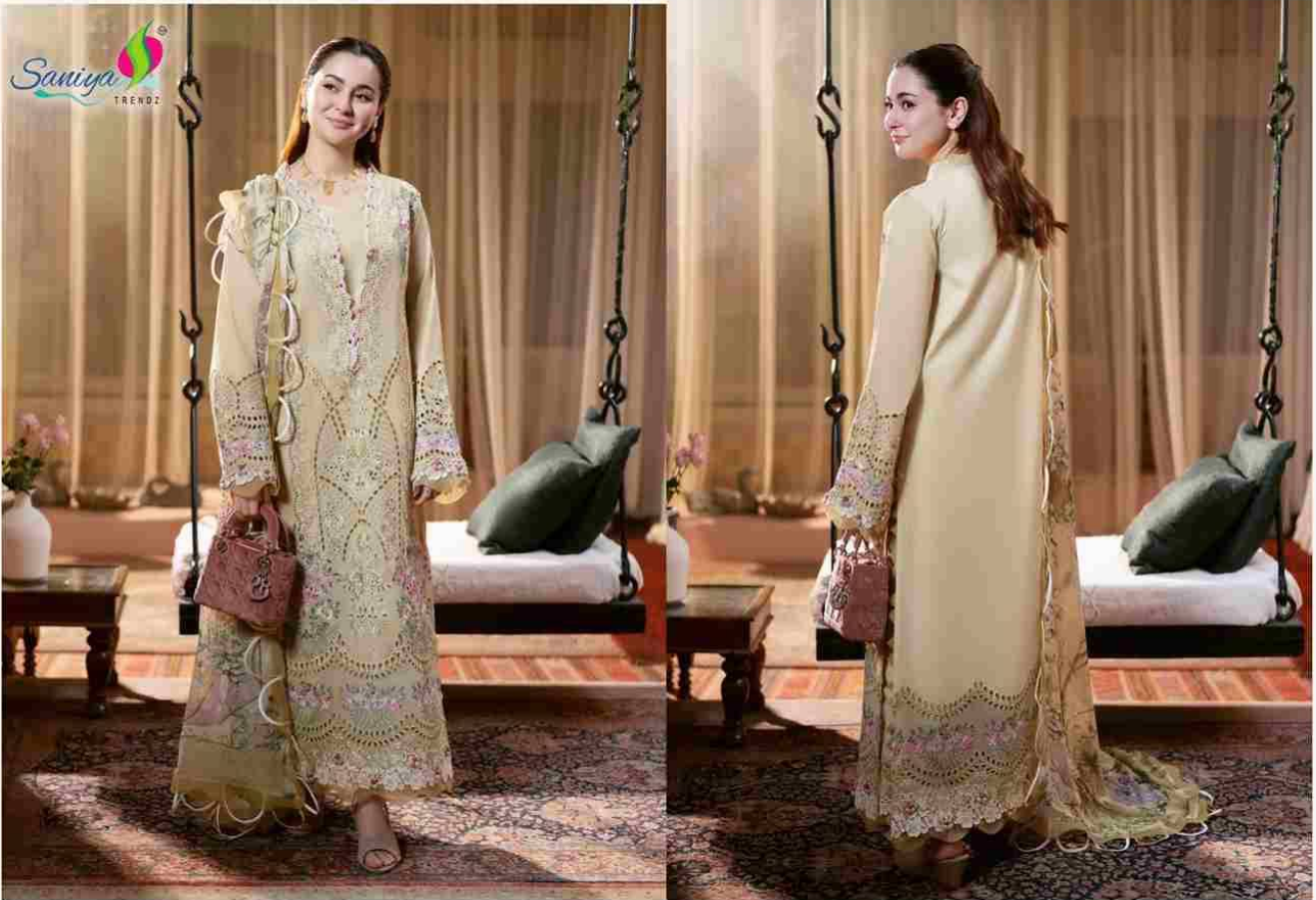
Perfect pastel yellow adorned with delicate floral motifs that exude understated elegance for those intimate moments as a newly married couple, its airy fabric and timeless embroidery blend tradition with sophistication D NO 25003