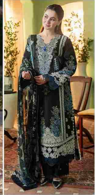
D NO 25005