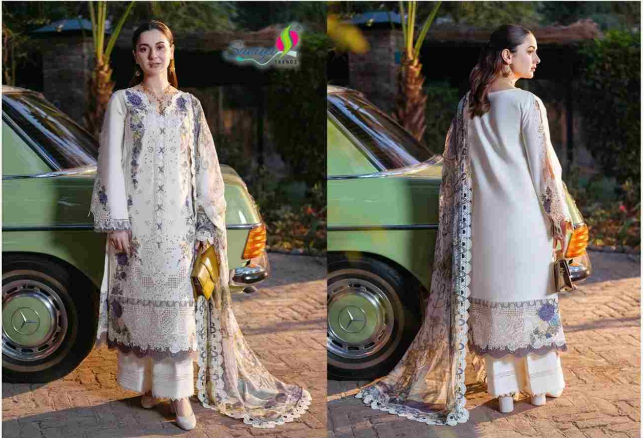
In her soft white floral dress, she radiates romantic charm, ready to share every moment of her day with the one she's waited for.