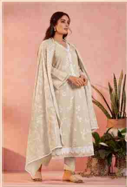
Muse - 1005