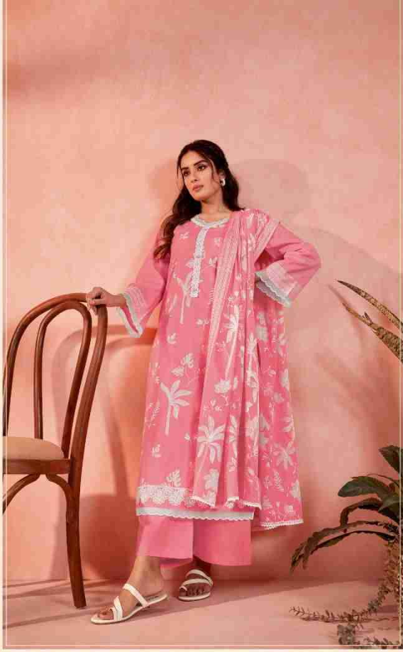
Muse - 1003