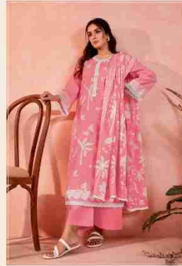
Muse - 1003