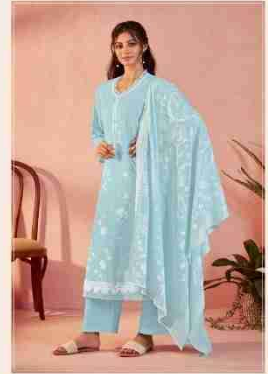
Muse - 1004