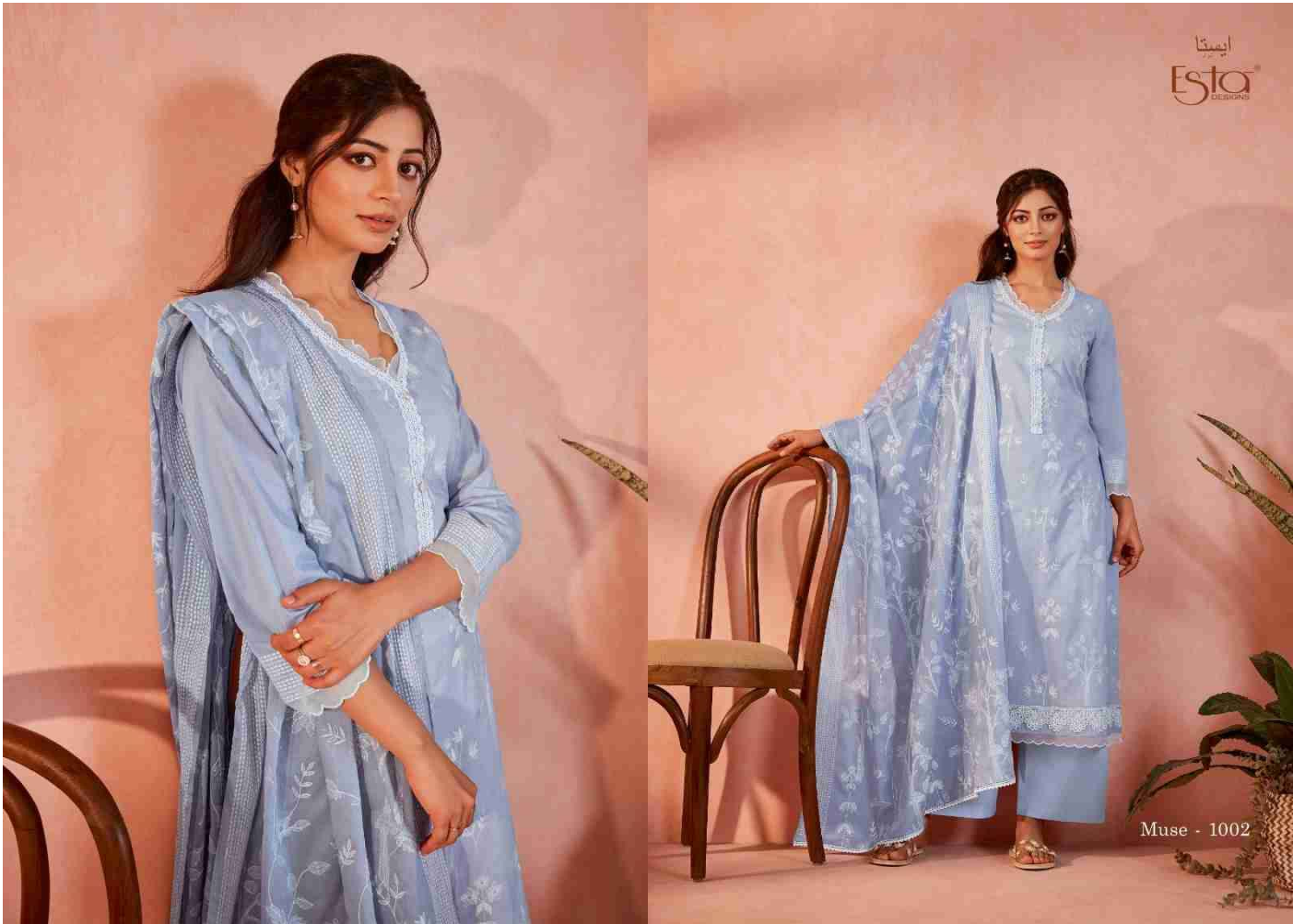
Muse - 1002