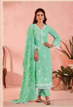
Muse - 1007