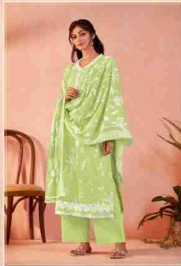
Muse - 1006