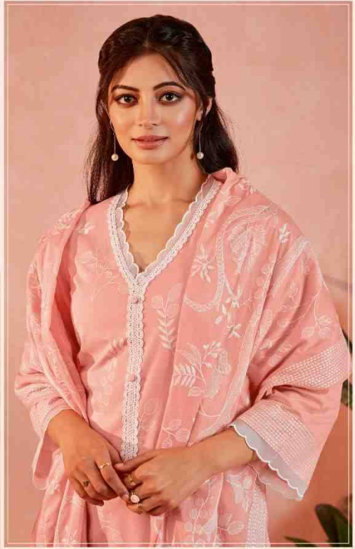
Muse - 1001