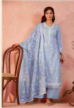
Muse - 1002