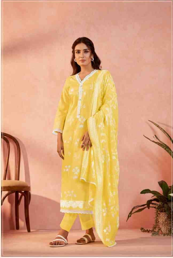
Muse - 1008