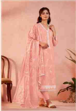
Muse - 1001