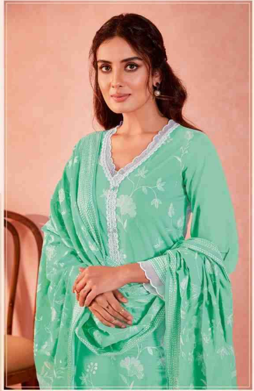
Muse - 1007