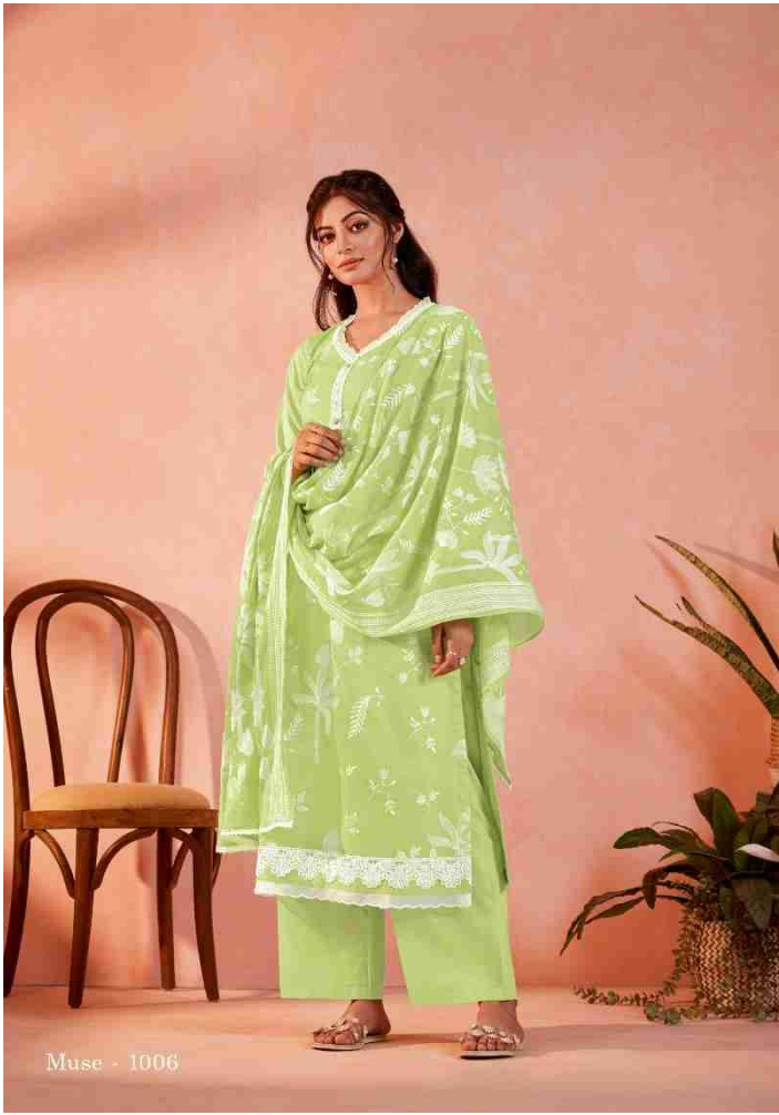
Muse - 1006