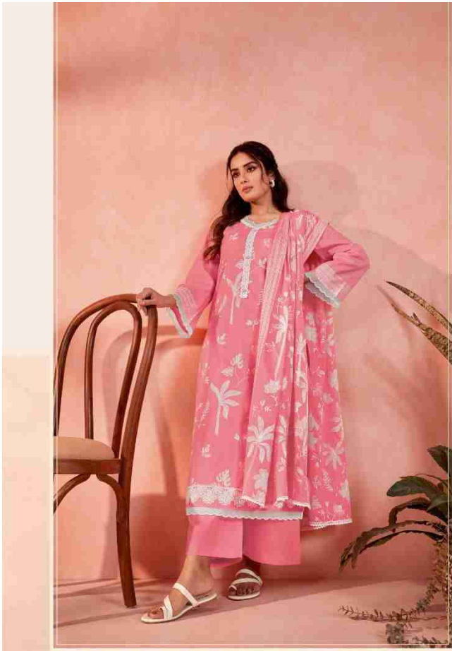
Muse - 1003