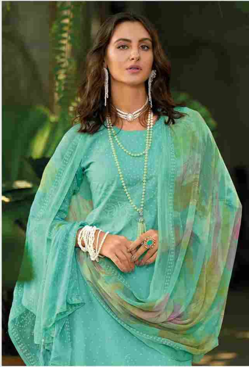
FASHION IS A SAGA