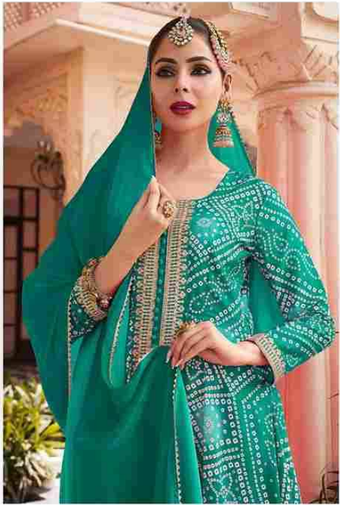
Draped in the essence of charm, every fold and curve tells a story of effortless beauty and refinement.