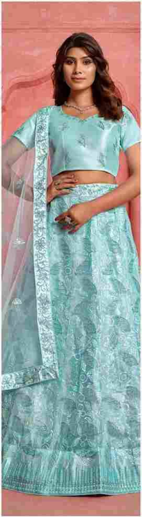
₹ 1004 A ₹