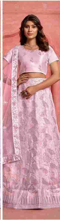
₹ 1004 E ₹