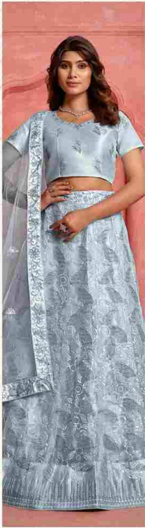
₹ 1004 C ₹