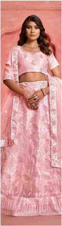
₹ 1004 B ₹