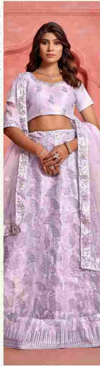
₹ 1004 D ₹