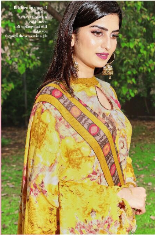
style # 11005

Brighten up yourself with an array of floral in cool linen soft surface that will take you through the season in style