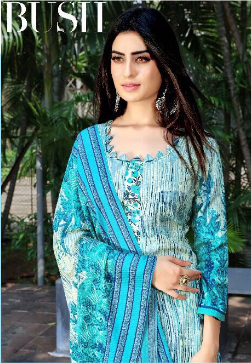
style # 11008