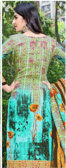
The Eternal Collection to define the purity of fashion style # 11003