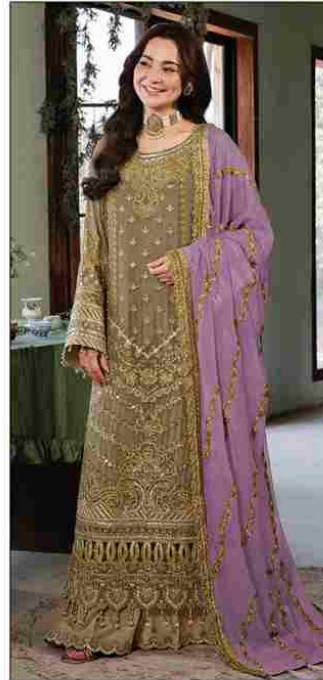
S 645 C