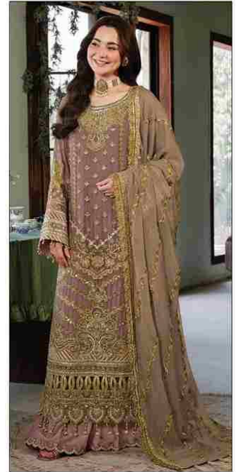
S 645 D