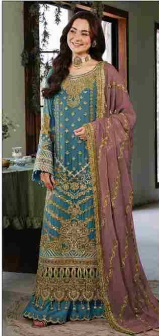
S 645 A