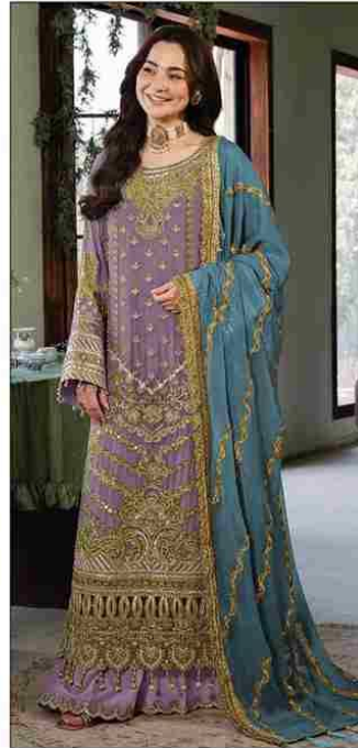
S 645 B