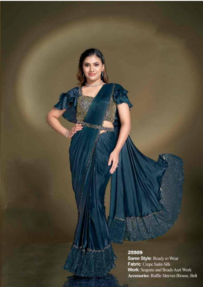
25509 Saree Style: Ready to Wear Fabric: Crepe Satin Silk Work: Sequins and Beads Aari Work Accessories: Ruffle Sleeves Blouse, Belt