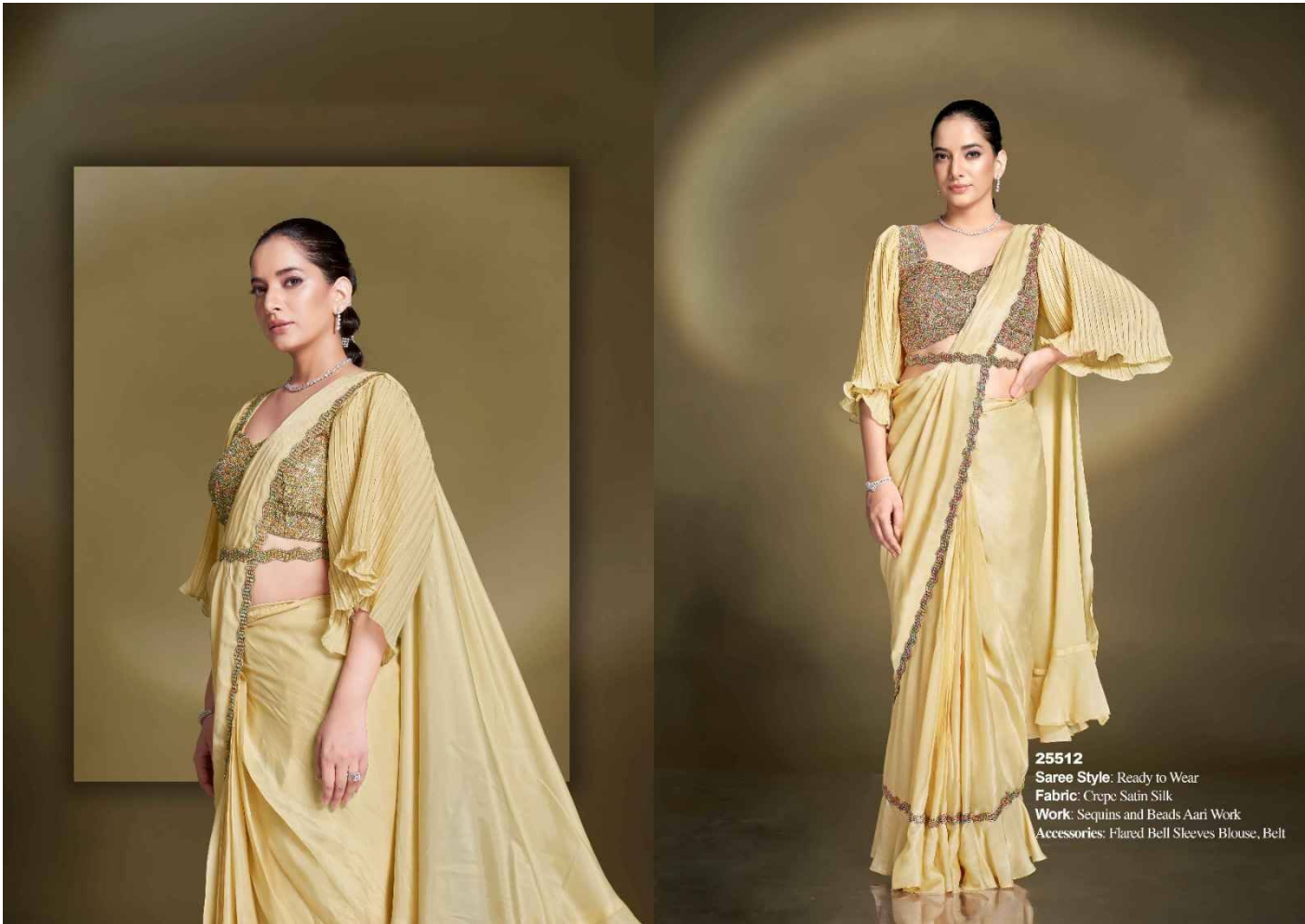
25512 Saree Style: Ready to Wear Fabric: Crepe Satin Silk Work: Sequins and Beads Aari Work Accessories: Flared Bell Sleeves Blouse, Belt