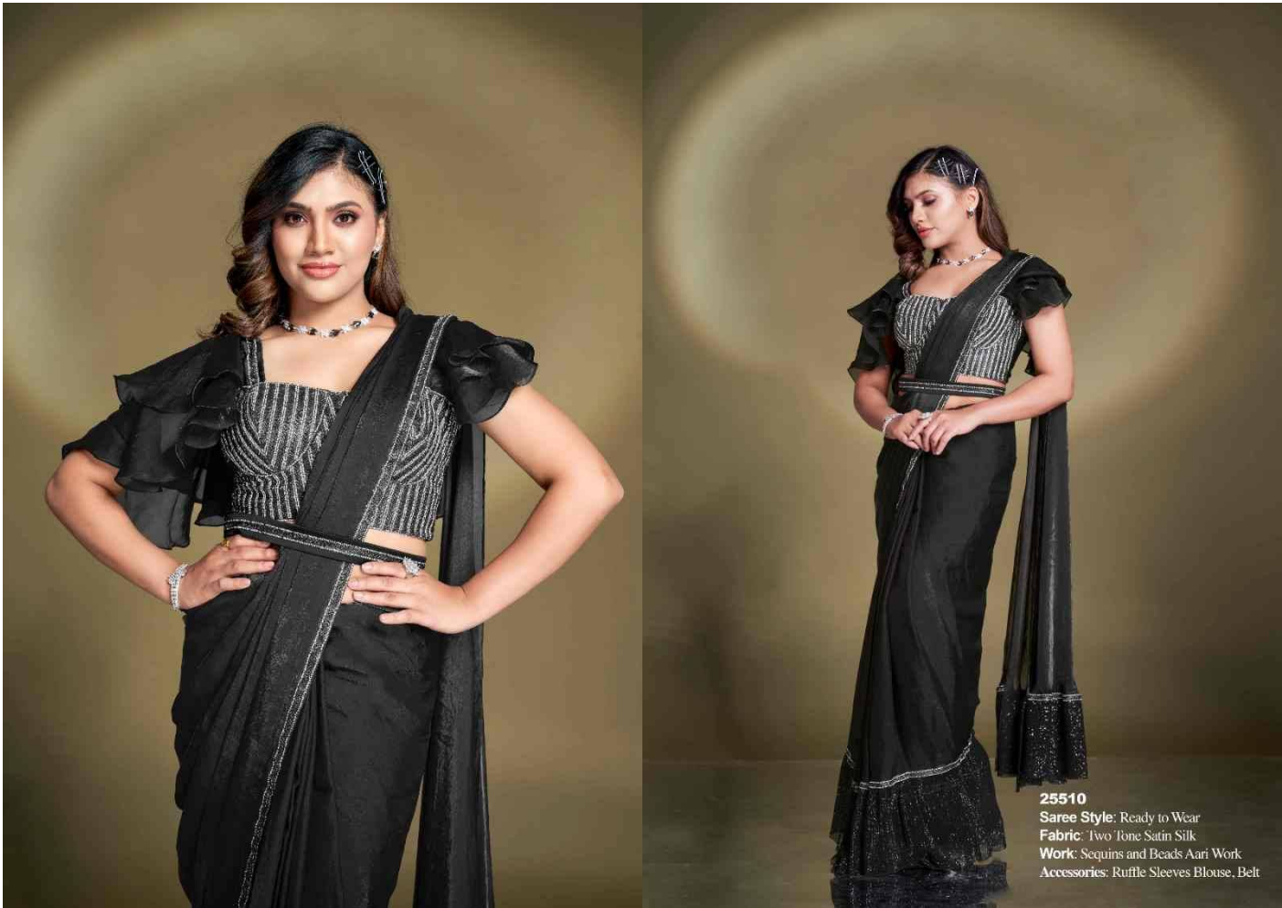
25510 Saree Style: Ready to Wear Fabric: Two Tone Satin Silk Work: Sequins and Beads Aari Work Accessories: Ruffle Sleeves Blouse, Belt