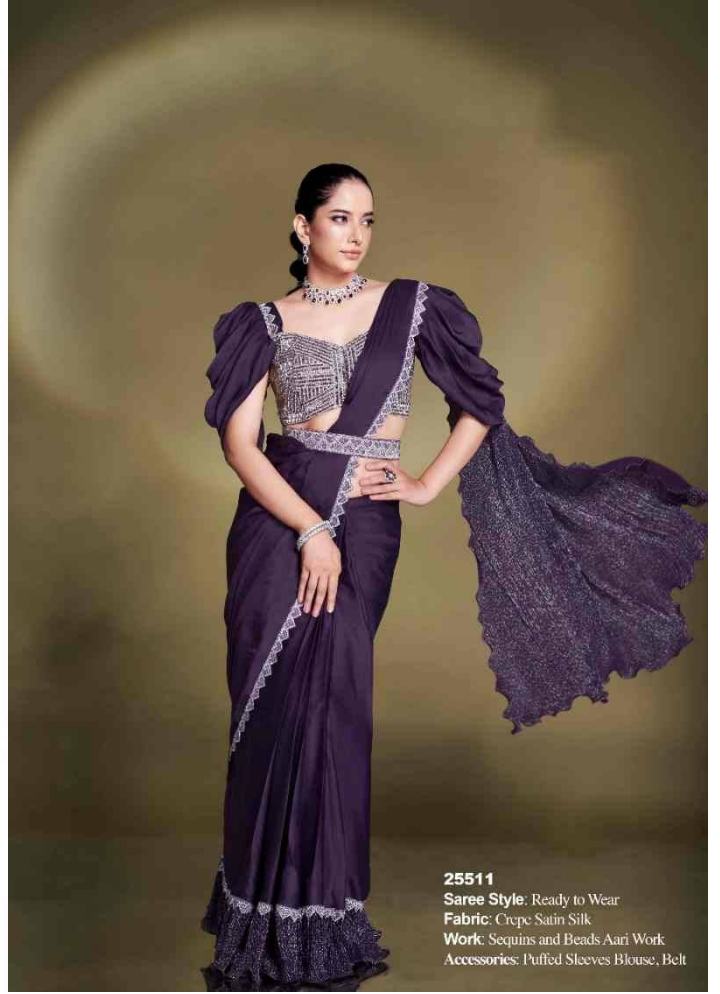
25511 Saree Style: Ready to Wear Fabric: Crepe Satin Silk Work: Sequins and Beads Aari Work Accessories: Puffed Sleeves Blouse, Belt