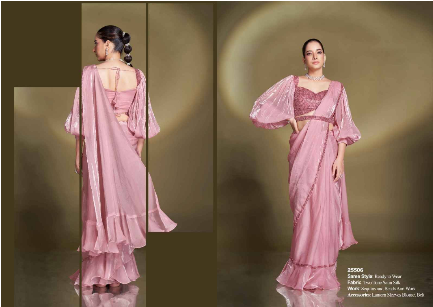
25506 Saree Style: Ready to Wear Fabric: Two Tone Satin Silk Work: Sequins and Beads Aari Work Accessories: Lantern Sleeves Blouse, Belt