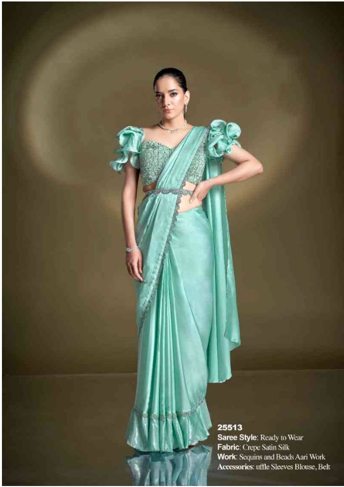
25513 Saree Style: Ready to Wear Fabric: Crepe Satin Silk Work: Sequins and Beads Aari Work Accessories: tulle Sleeves Blouse, Belt