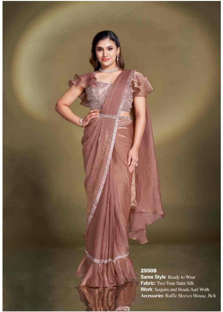
25508 Saree Style: Ready to Wear Fabric: Two Tone Satin Silk Work: Sequins and Beads Aari Work Accessories: Ruffle Sleeves Blouse, Belt