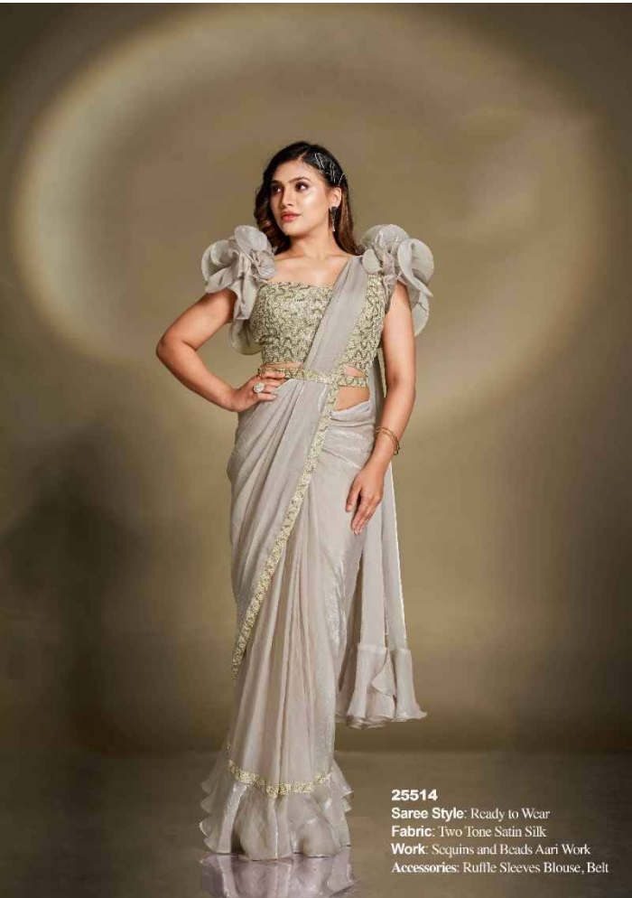
25514 Saree Style: Ready to Wear Fabric: Two Tone Satin Silk Work: Sequins and Beads Aari Work Accessories: Ruffle Sleeves Blouse, Belt