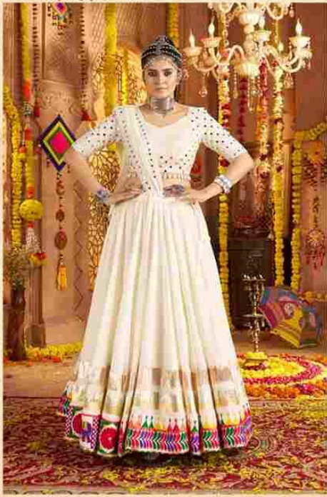
RASS - 11003