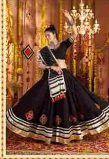
RASS - 11004