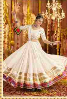
RASS - 11003