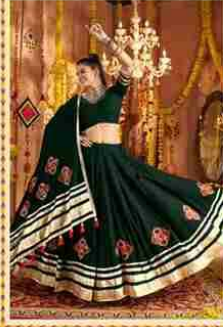
RASS - 11006