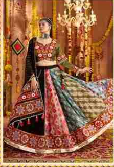
RASS - 11002