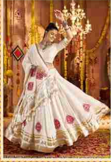
RASS - 11005