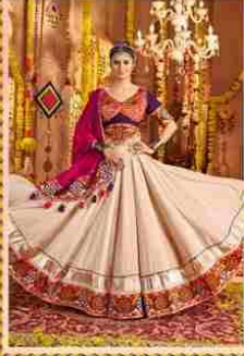
RASS - 11001