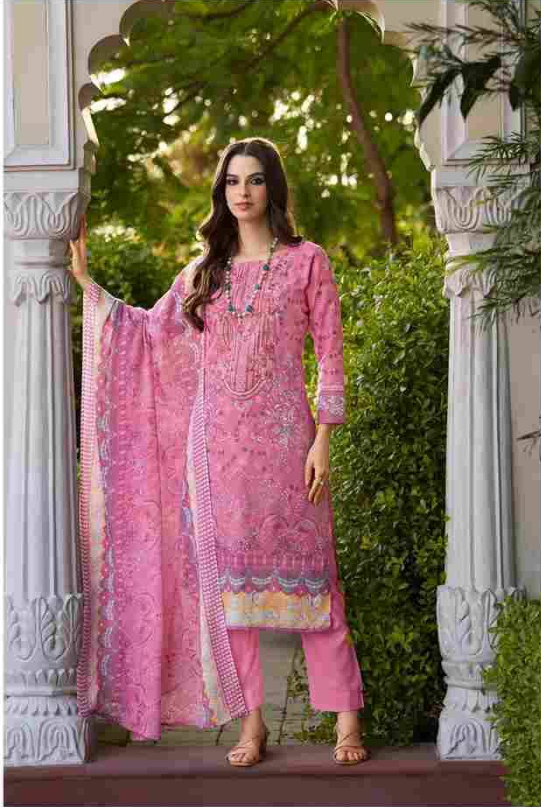
"Being well dressed hasn't much to do with having good clothes. It's a question of good balance and good common sense." D.NO:694-001