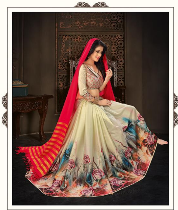
Reflective Fashion The range of fashion fabric that are energetic, spontaneous and fresh