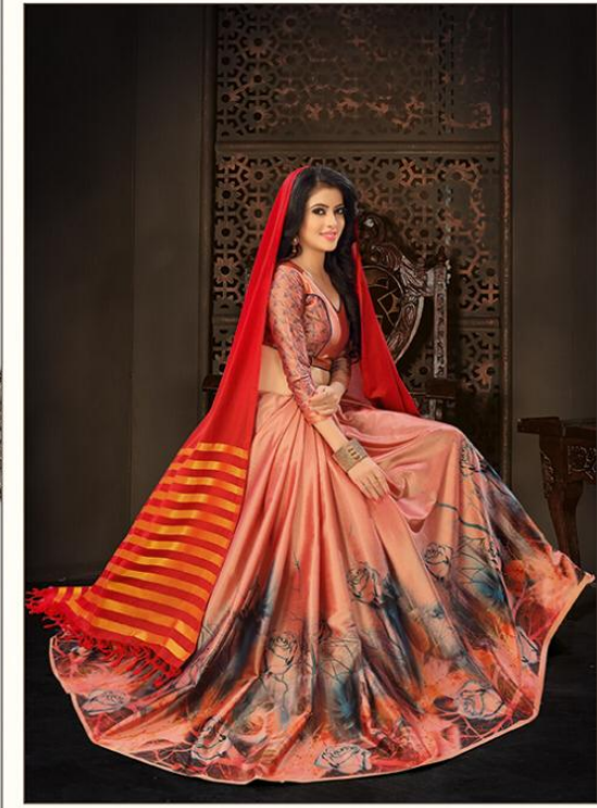
Fresh Crop The season's newest silhouettes Elegg, hold blooms in their fabrics - flower has never been so striking...