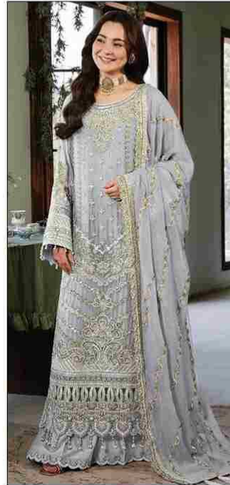
S 645 C