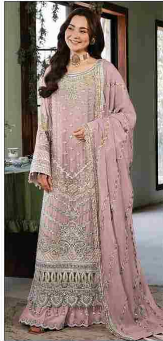
S 645 B