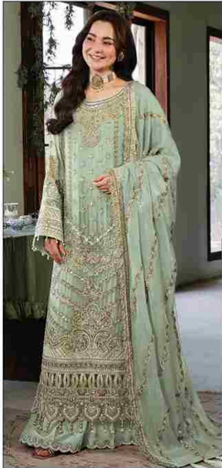
S 645 A