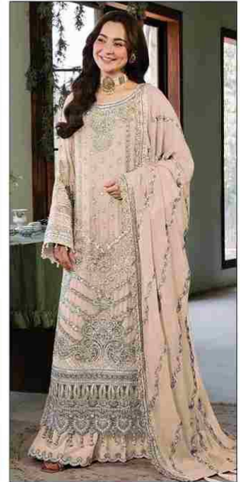
S 645 D