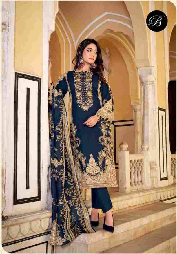
The gorgeous combination of geometrical design with young charming colours. 920-004