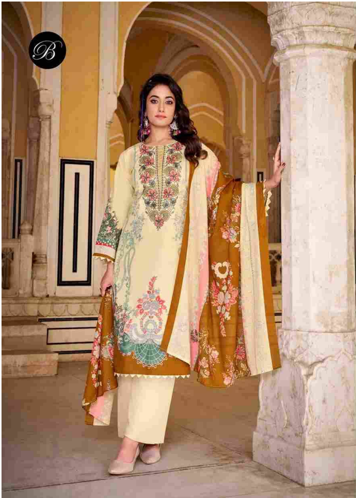
The silent colours and beautiful print provide a spark to the persona.