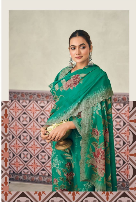
Conforming to good taste LOOK | 3006