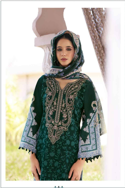
"Fashion is very important. It is life-enhancing and, like everything that gives pleasure, it is worth doing well." D.NO:960-006