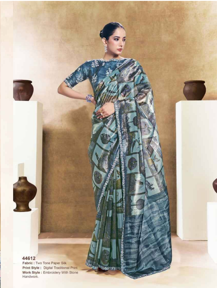
44612 Fabric : Two Tone Paper Silk Print Style : Digital Traditional Print Work Style : Embroidery With Stone Handwork.