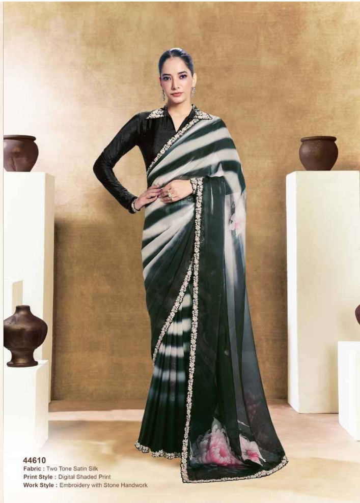
44610 Fabric : Two Tone Satin Silk Print Style : Digital Shaded Print Work Style : Embroidery with Stone Handwork