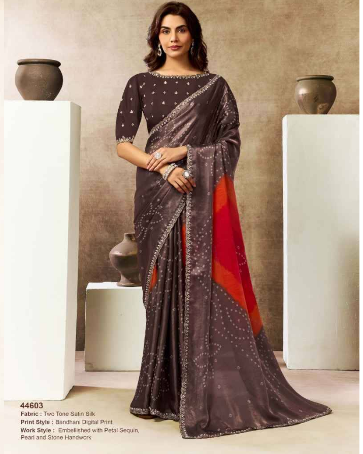
44603 Fabric : Two Tone Satin Silk Print Style : Bandhani Digital Print Work Style : Embellished with Petal Sequin, Pearl and Stone Handwork