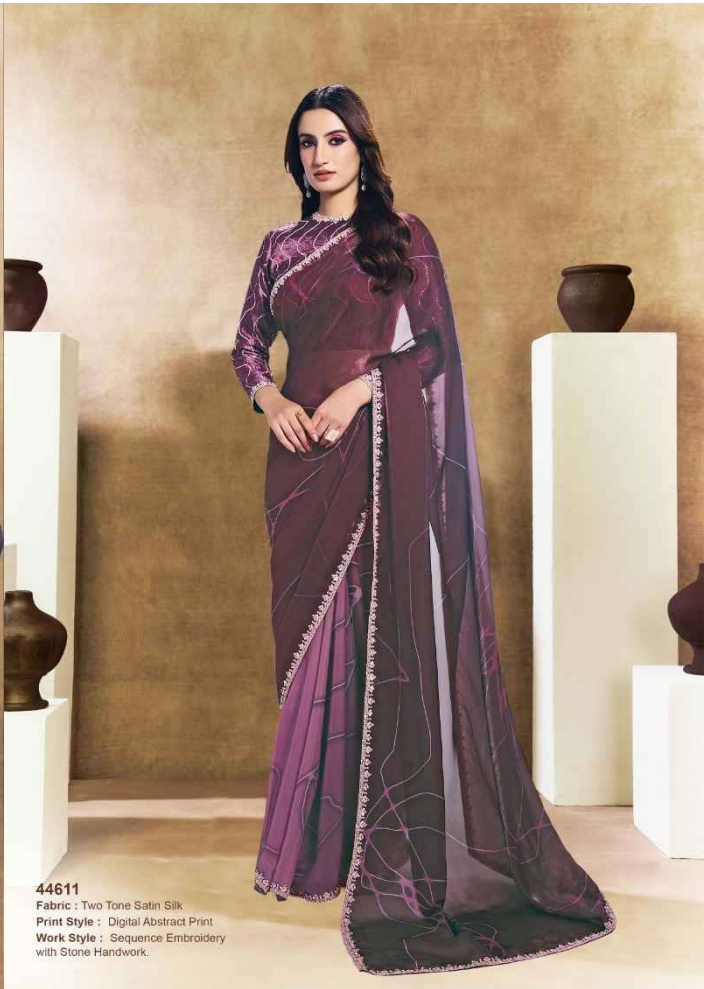
44611 Fabric : Two Tone Satin Silk Print Style : Digital Abstract Print Work Style : Sequence Embroidery with Stone Handwork.