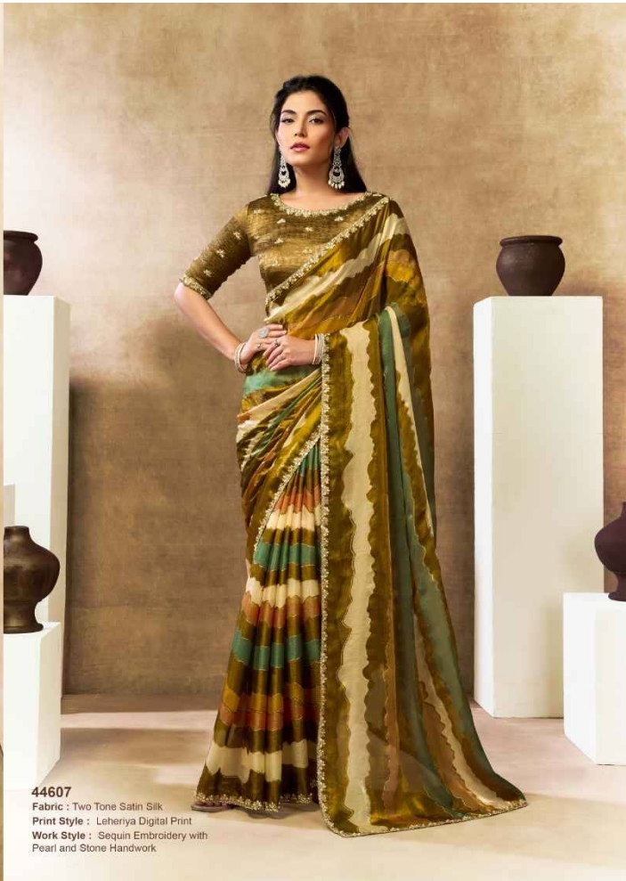
44607 Fabric : Two Tone Satin Silk Print Style : Leheriya Digital Print Work Style : Sequin Embroidery with Pearl and Stone Handwork