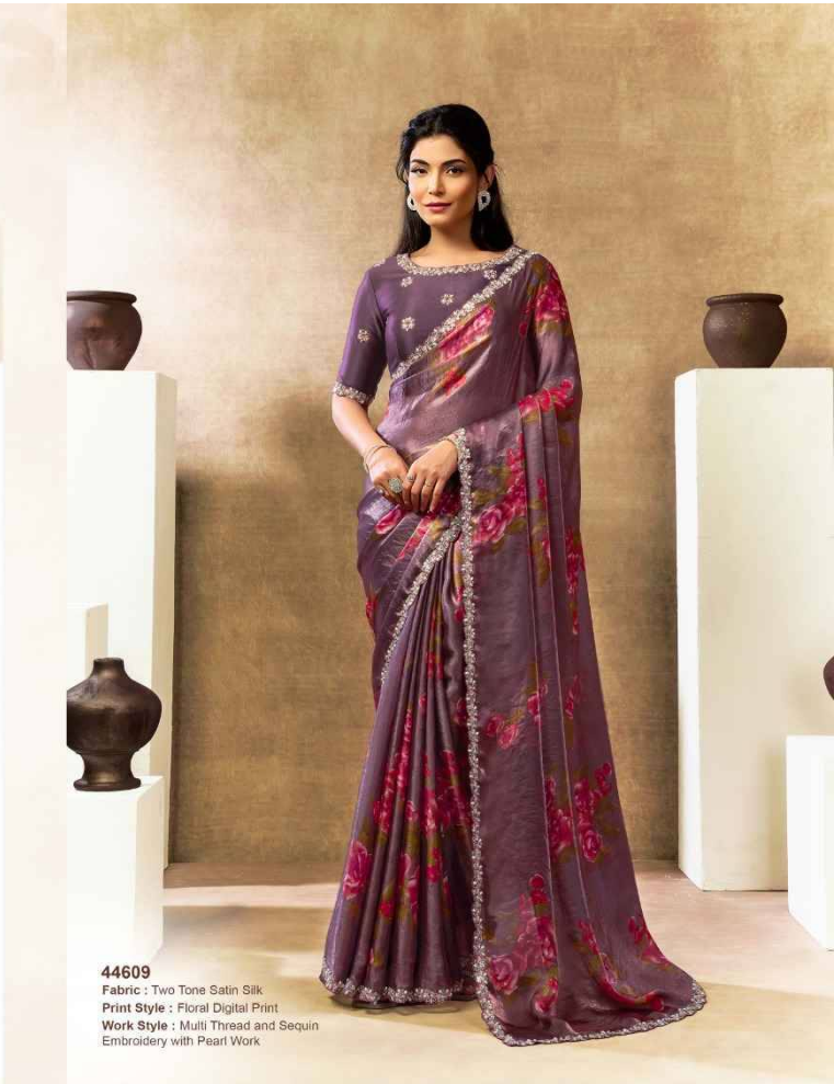
44609 Fabric : Two Tone Satin Silk Print Style : Floral Digital Print Work Style : Multi Thread and Sequin Embroidery with Pearl Work