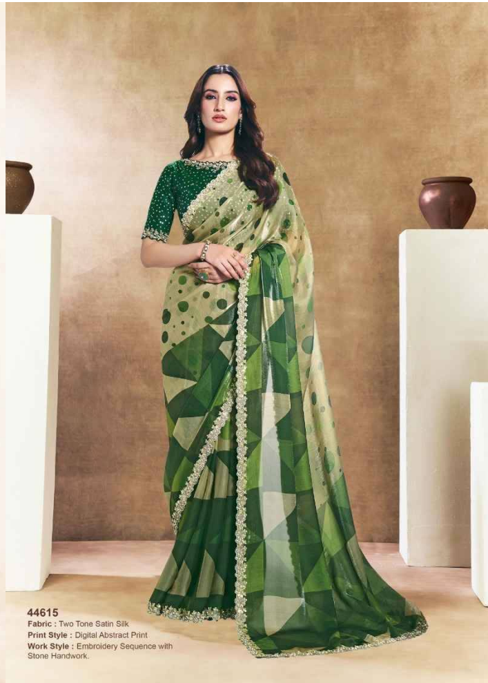
44615 Fabric : Two Tone Satin Silk Print Style : Digital Abstract Print Work Style : Embroidery Sequence with Stone Handwork.