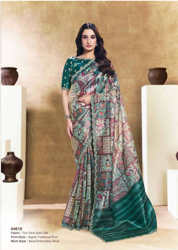
44616 Fabric : Two Tone Satin Silk Print Style : Digital Traditional Print Work Style : Bead Embroidery Work.