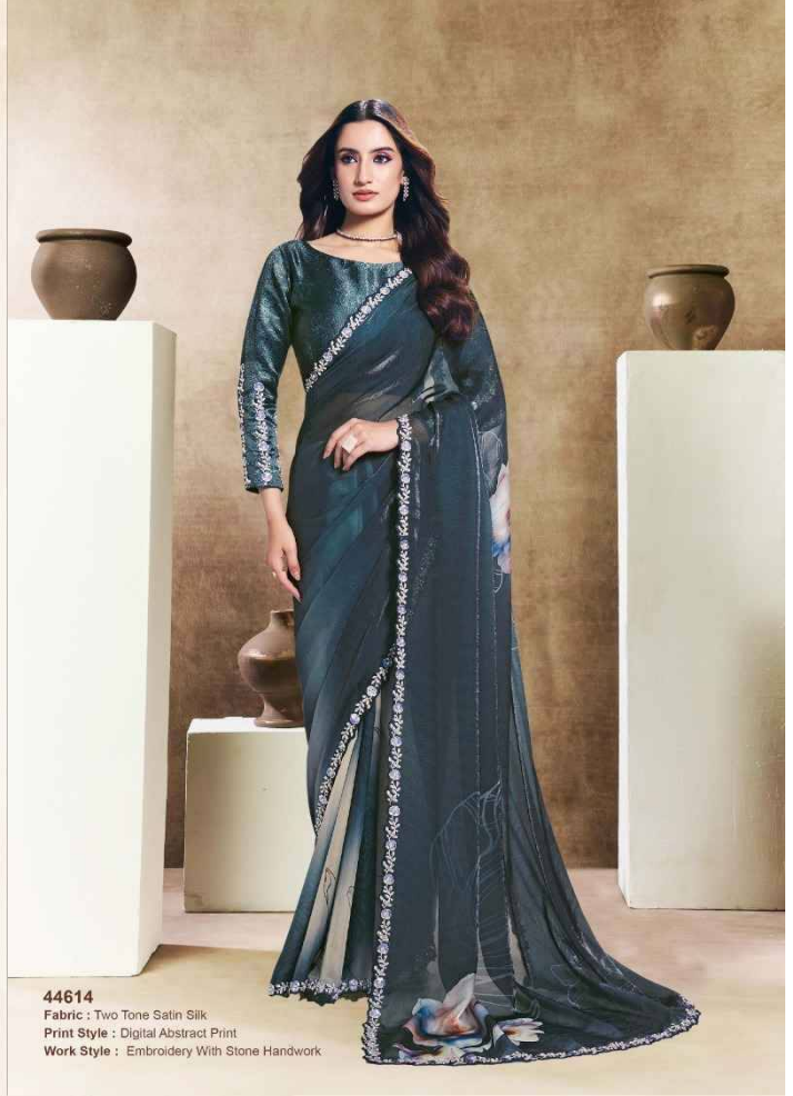
44614 Fabric : Two Tone Satin Silk Print Style : Digital Abstract Print Work Style : Embroidery With Stone Handwork