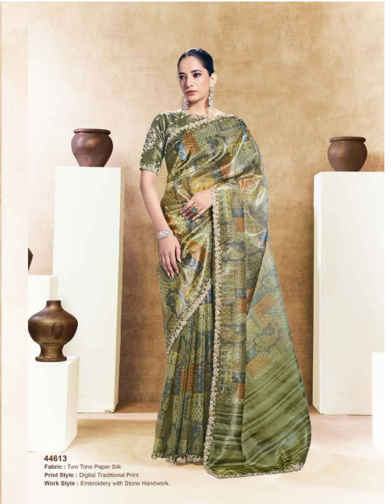
44613 Fabric : Two Tone Paper Silk Print Style : Digital Traditional Print Work Style : Embroidery with Stone Handwork.