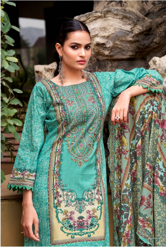
CRAFTED FOR MOMENTS THAT MATTER. STYLED FOR MEMORIES THAT LAST.