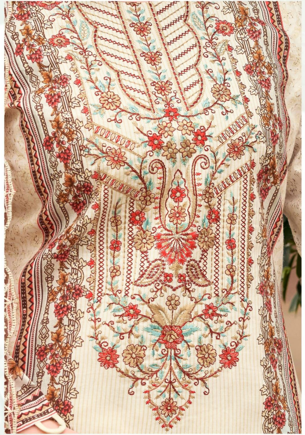
A CELEBRATION OF INDIAN CRAFTSMANSHIP. INTERPRETED FOR TODAY'S AESTHETIC.