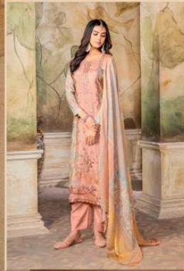
Bani 9071 B