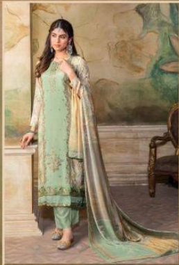
Bani 9071 C