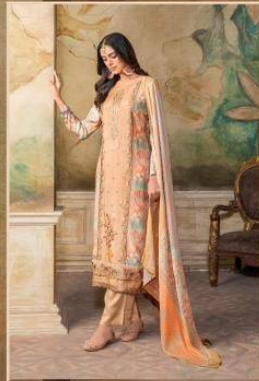
Bani 9071 D