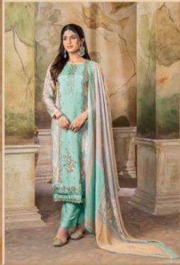
Bani 9071 A