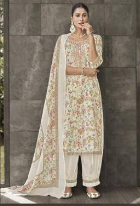
3685 A ❖