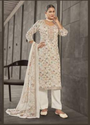
3688 B ❖