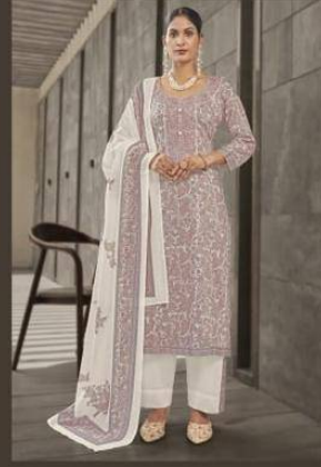
3686 A ❖