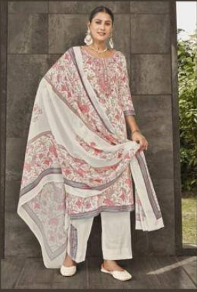
3687 A ❖