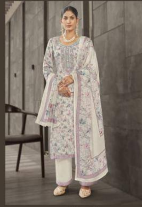
3688 A ❖