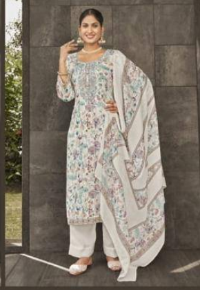
3685 B ❖