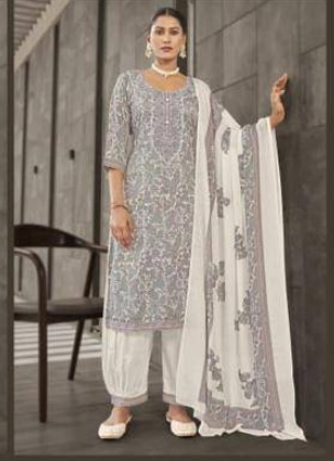
3686 B ❖