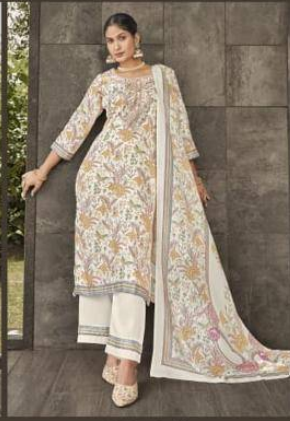
3687 B ❖