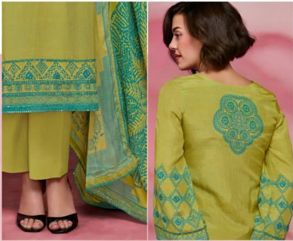
Chard Tere moonlit elegance woven into effortless summer silhouettes.