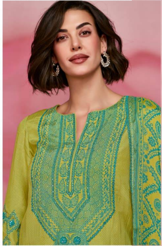
Chand Taw inspired elegance woven into effortless summer silhouettes. H-0065