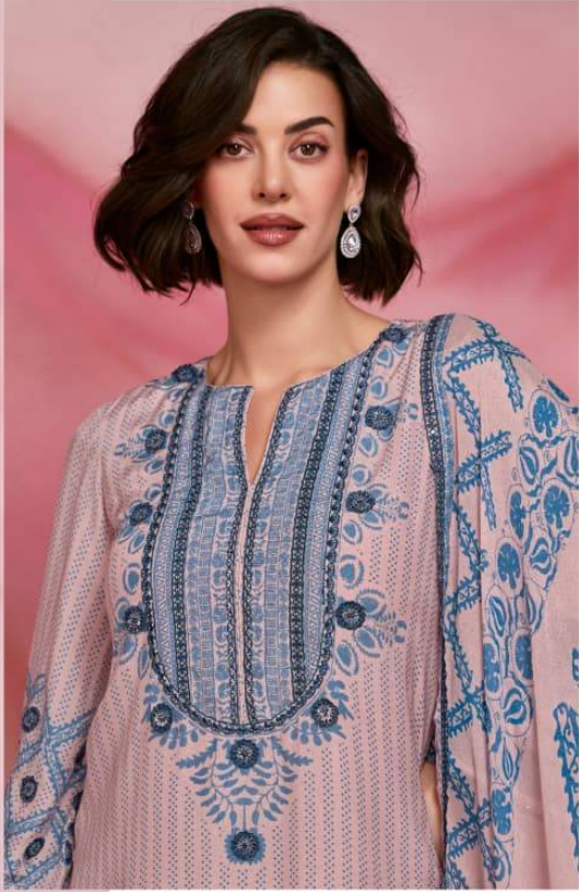
H-0064 Chand Tara a blend of celestial beauty and summer ease.