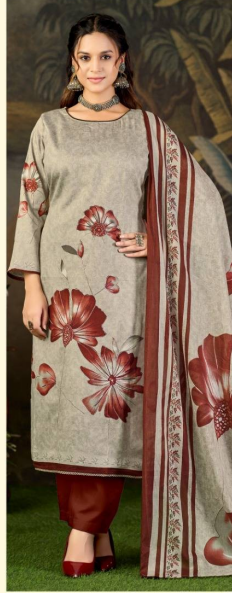
D.No. 230- A