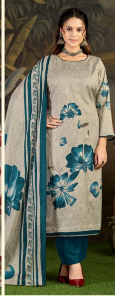
D.No. 230- B