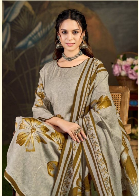
A bohemian blue dress with incredible stone work is the height of sophistication D.No.230-D