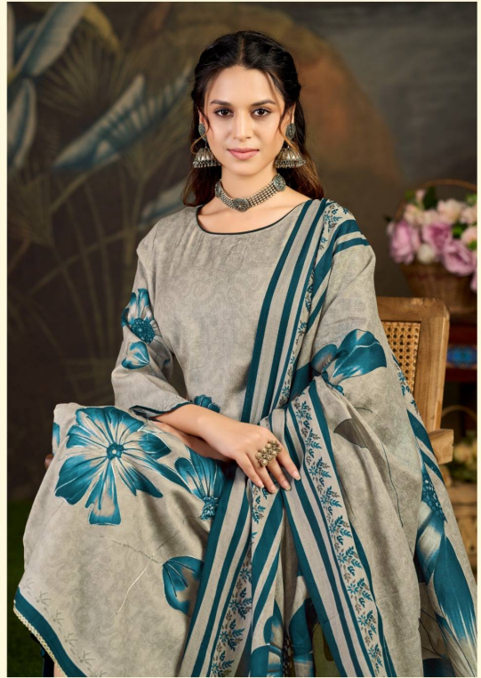
A boarxtomn bla dress with incredible stone work is the height of sophistication D.No.230-B