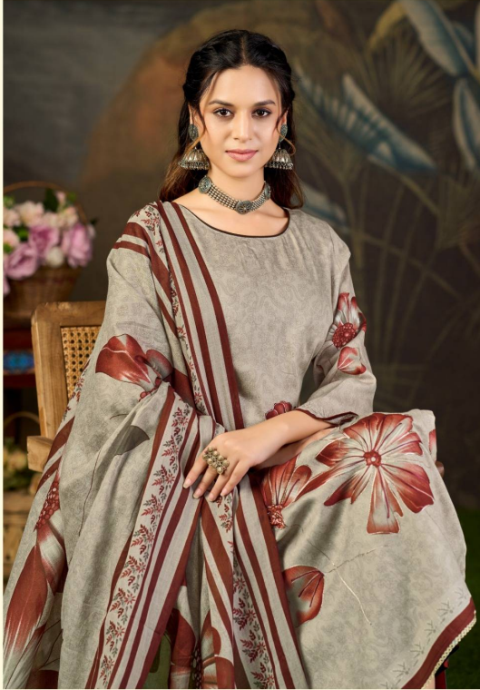
A beautiful blue dress with incredible stone work is the height of sophistication D.No.230-A