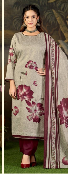
D.No. 230- C