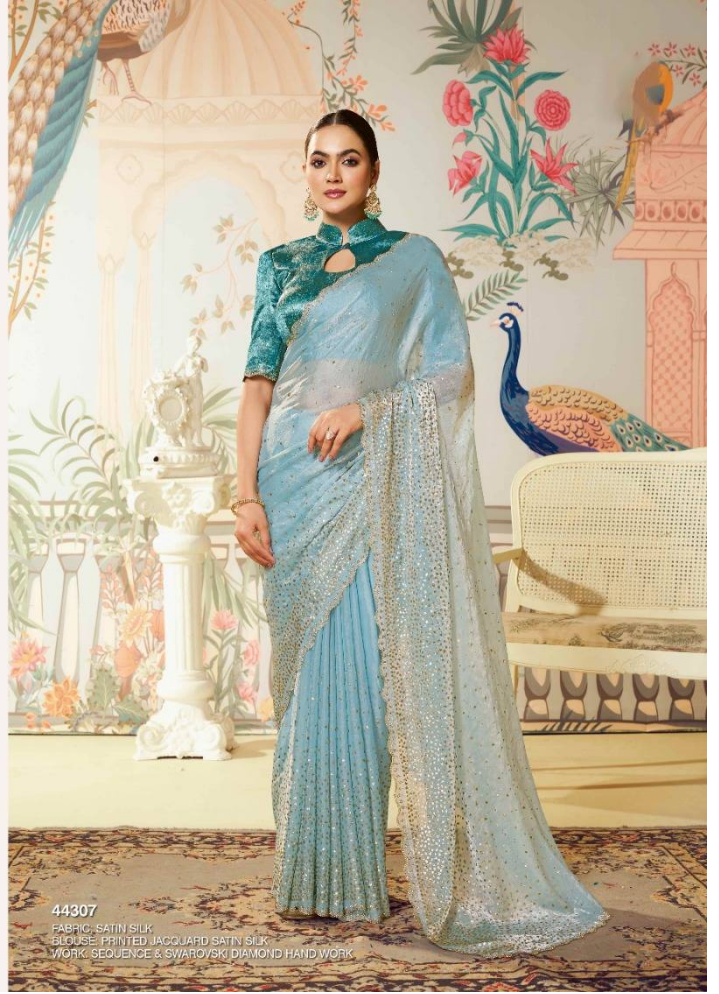
44307 FABRIC: SATIN SILK BLOUSE: PRINTED JACQUARD SATIN SILK WORK: SEQUINCE & SWAROVSKI DIAMOND HAND WORK