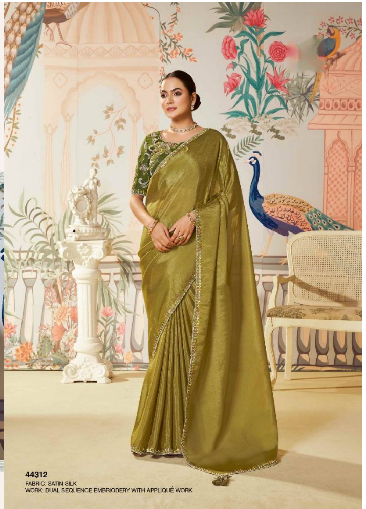
44312 FABRIC: SATIN SILK WORK: DUAL SEQUENCE EMBROIDERY WITH APPLIQUÉ WORK