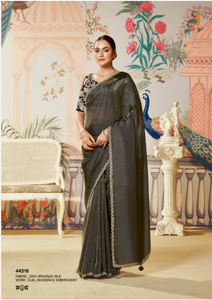
44316 FABRIC: ZARI ORGANZA SILK WORK: DUAL SEQUENCE EMBROIDERY