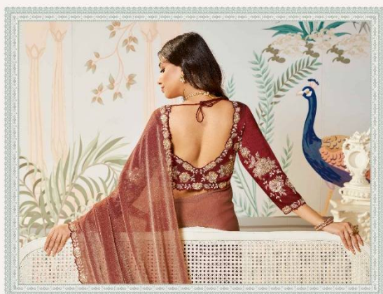
44304 FABRIC: MOSS SATIN SILK ORGANZA WORK: DUAL SEQUENCE EMBROIDERY WITH HANDWORK