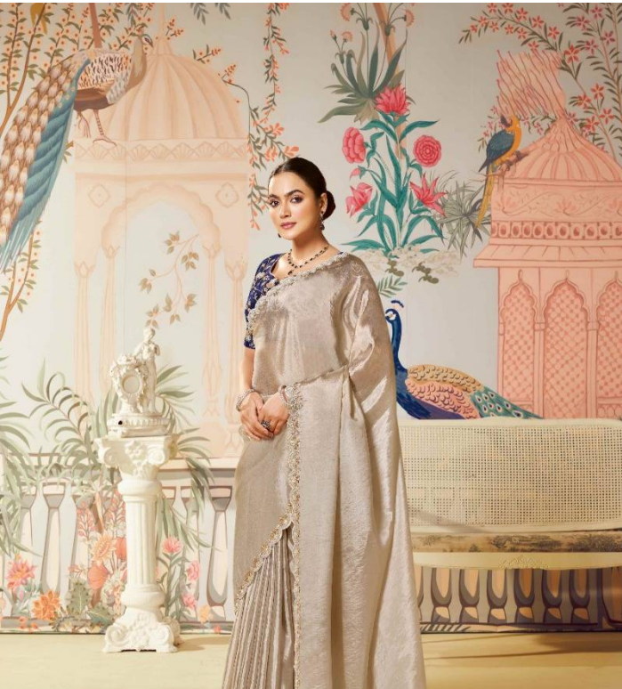
44303 FABRIC: TUSSAR SILK WORK: DUAL SEQUENCE WORK