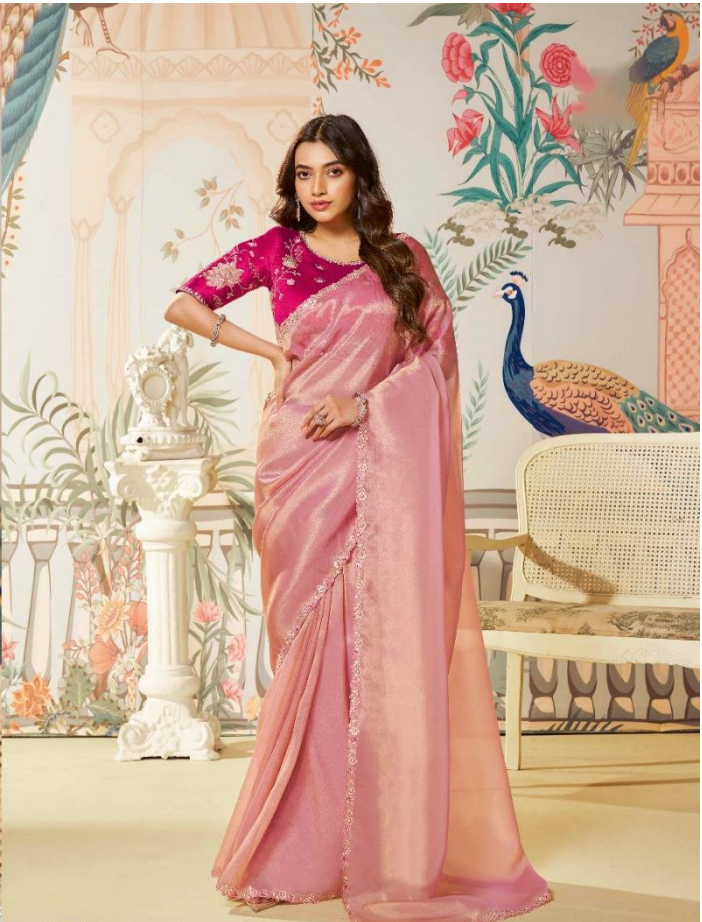
44308 FABRIC: ZARI ORGANZA SILK WORK: DUAL SEQUENCE EMBROIDERY WITH APPLIQUE WORK