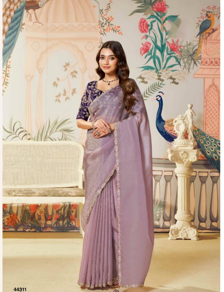
44311 FABRIC: ZARI ORGANZA SILK WORK: DUAL SEQUENCE EMBROIDERY WITH HANDWORK