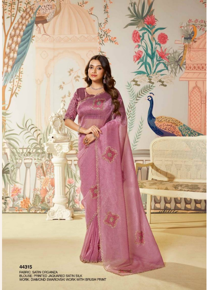
44315 FABRIC: SATIN ORGANZA BLOUSE: PRINTED JAQUARED SATIN SILK WORK: DIAMOND SWAROVSKI WORK WITH BRUSH PRINT