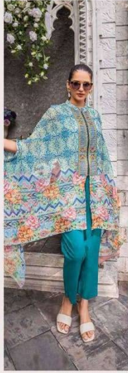
CAPE Style 3553