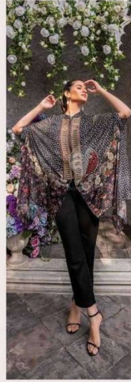
CAPE Style 3554