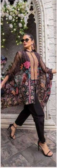
CAPE Style 3551