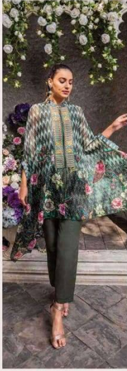
CAPE Style 3552