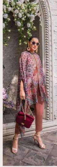
CAPE Style 3555