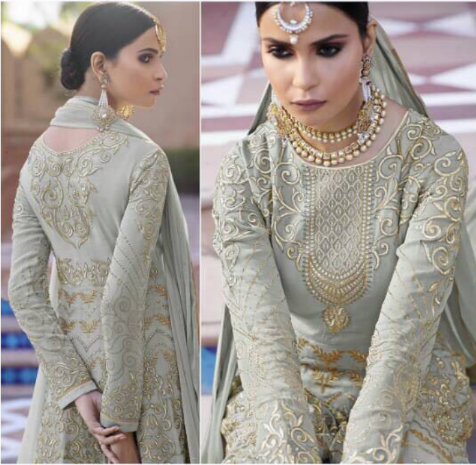
tharclassiest All images are subject to change without prior notice. © No. 11003